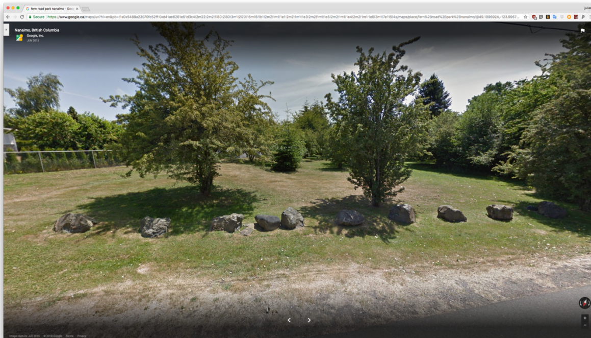
Figure 3 – Current Condition of Fern Road Park