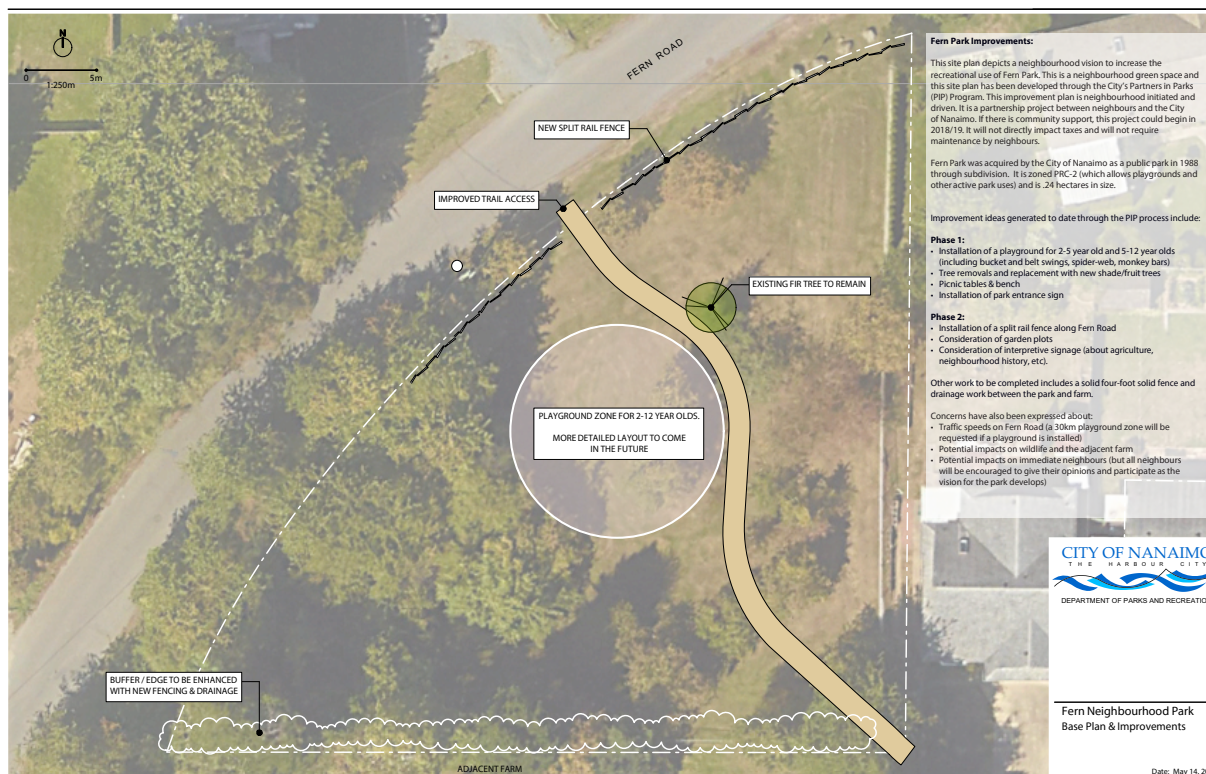
Figure 4 – Site Plan