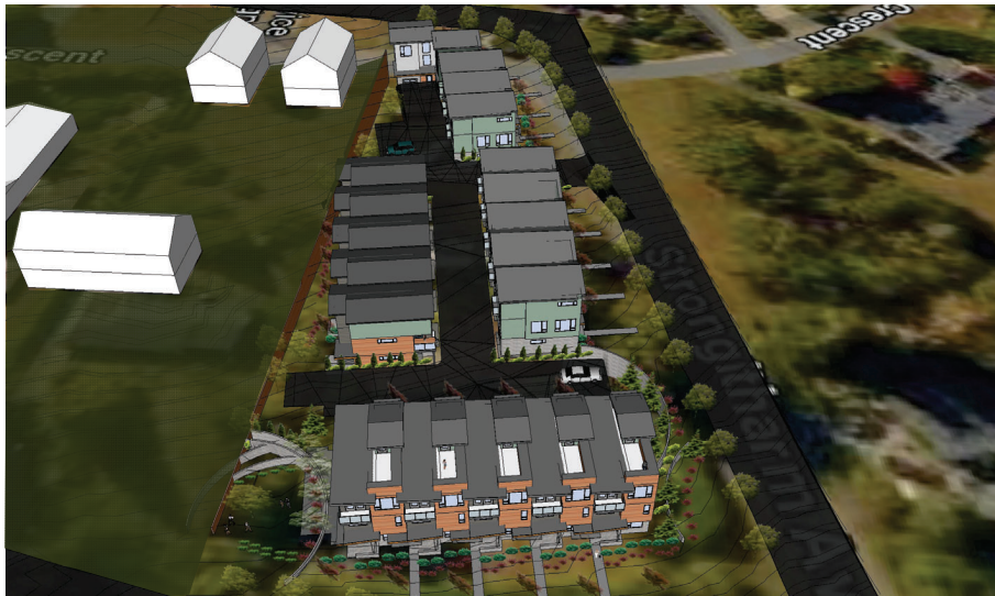
AERIAL VIEW FROM DEPARTURE BAY ROAD