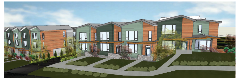
BUILDING 1 FROM STRONGTHARM ROAD