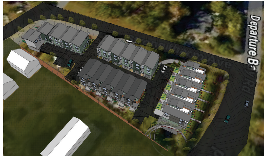
AERIAL VIEW FROM DEPARTURE BAY ROAD