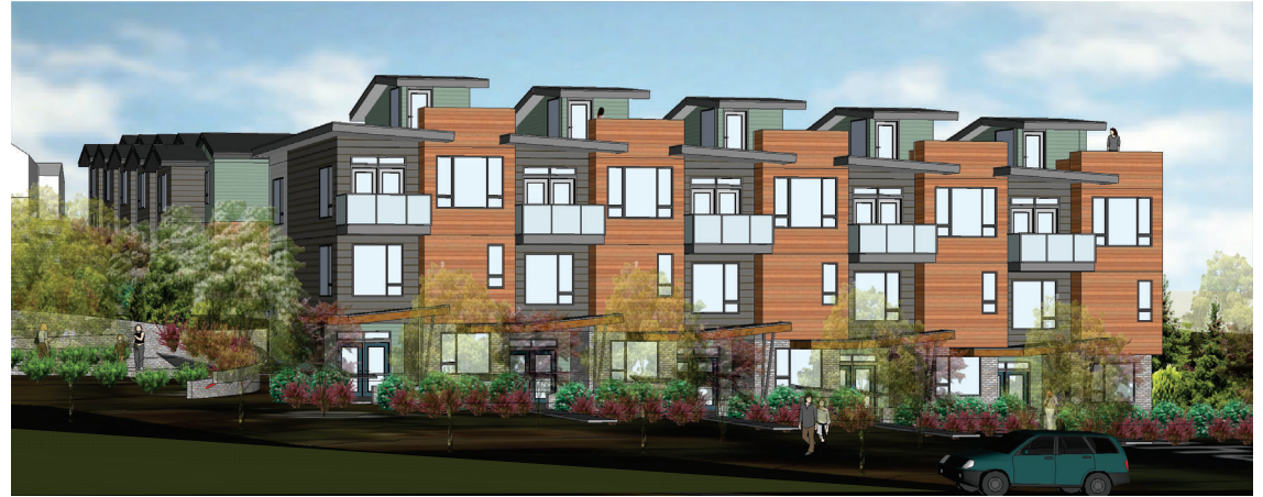
FRONT BUILDING 2 FROM STRONGTHARM ROAD