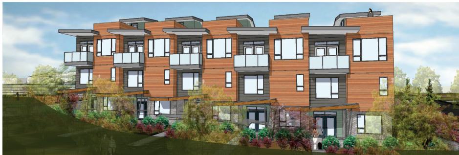
BUILDING 4 FROM DEPARTURE BAY ROAD