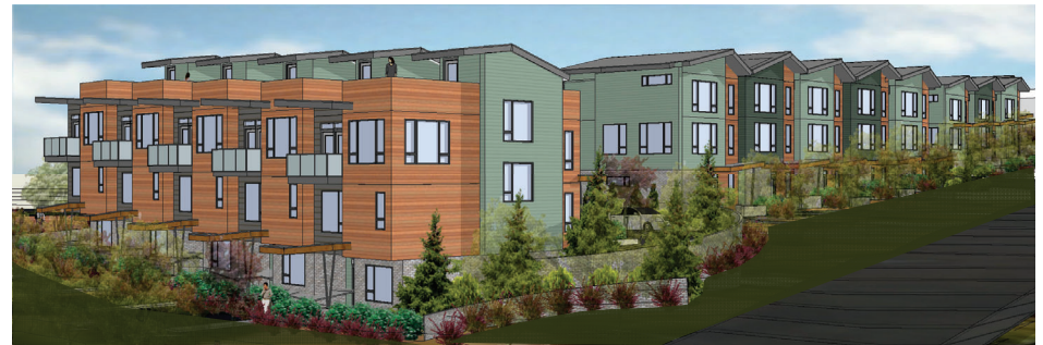
BUILDING 3 AND 4