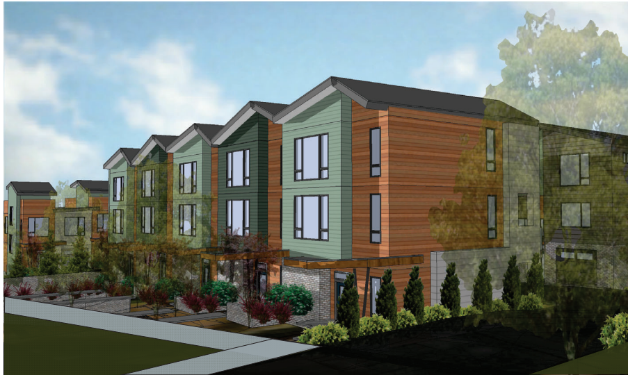
BUILDING 2 FROM STRONGATHARM ROAD