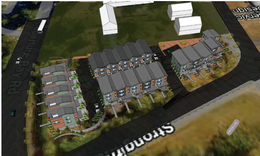
AERIAL VIEW FROM CORNER OF DEPARTURE BAY AND STRONGTHARM