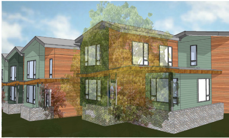
FRONT CORNER VIEW, BUILDING 1 FROM STRONGTHARM ROAD