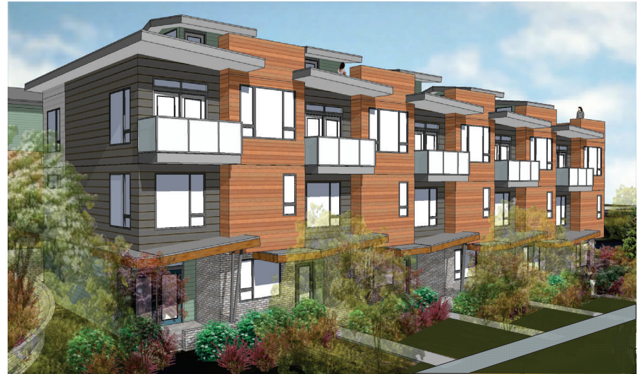
BUILDING 4 FROM DEPARTURE BAY ROAD