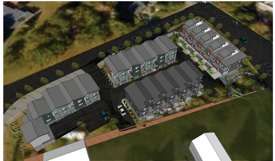
AERIAL VIEW FROM REAR OF LOTS