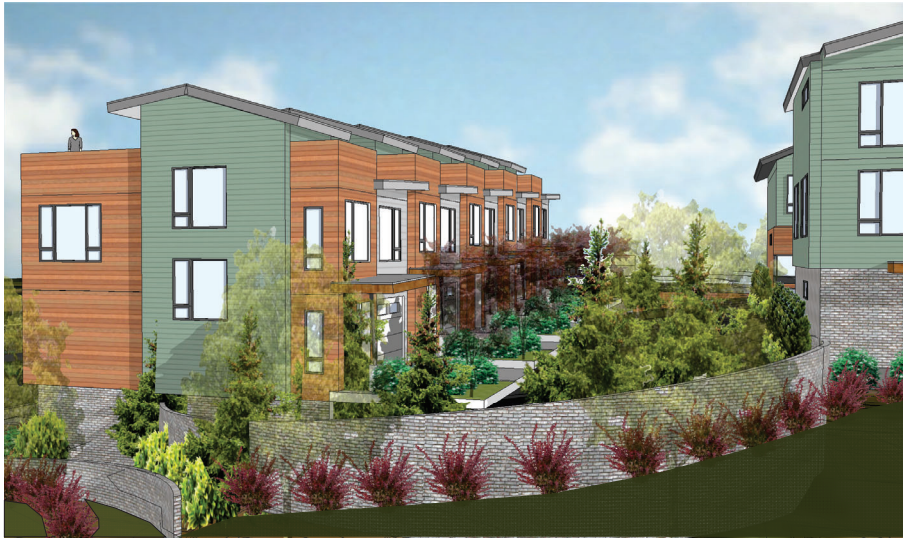
VIEW BETWEEN BUILDING 2 & 4