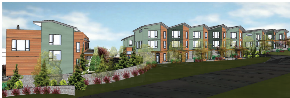
BUILDING 4 FROM STRONGTHARM ROAD