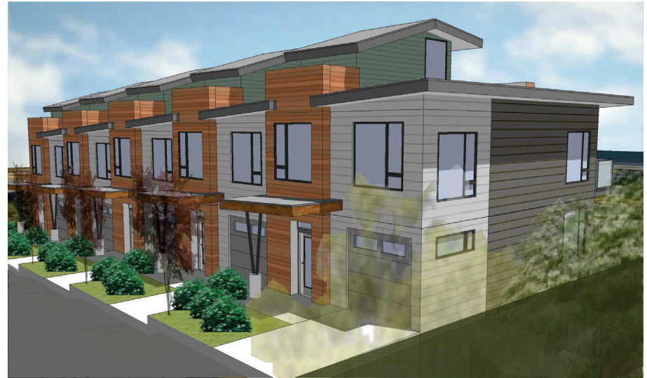
BUILDING 2 FROM DRIVELANE