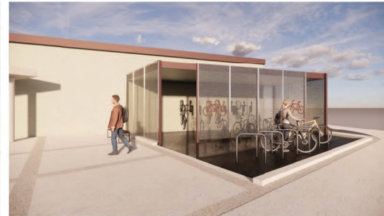
THREE QUARTER VIEW DOORS OPEN