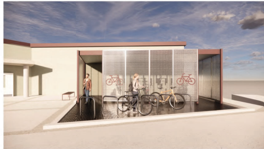
FRONT VIEW DOORS OPEN