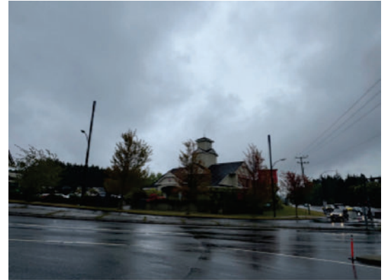
Artistic representation of the tower in the current landscape.