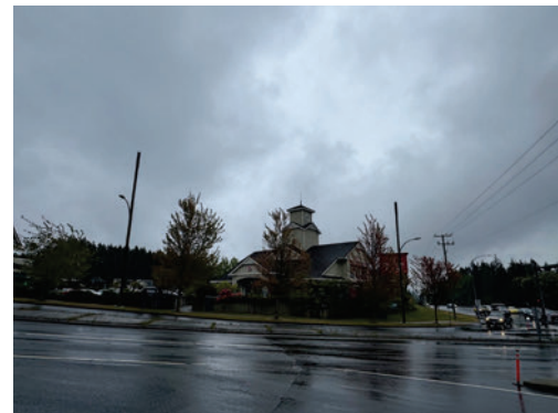
View after proposed tower, looking northeast.