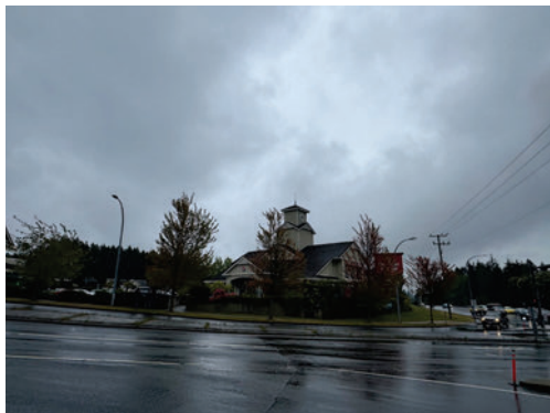
View before proposed tower, looking northeast.