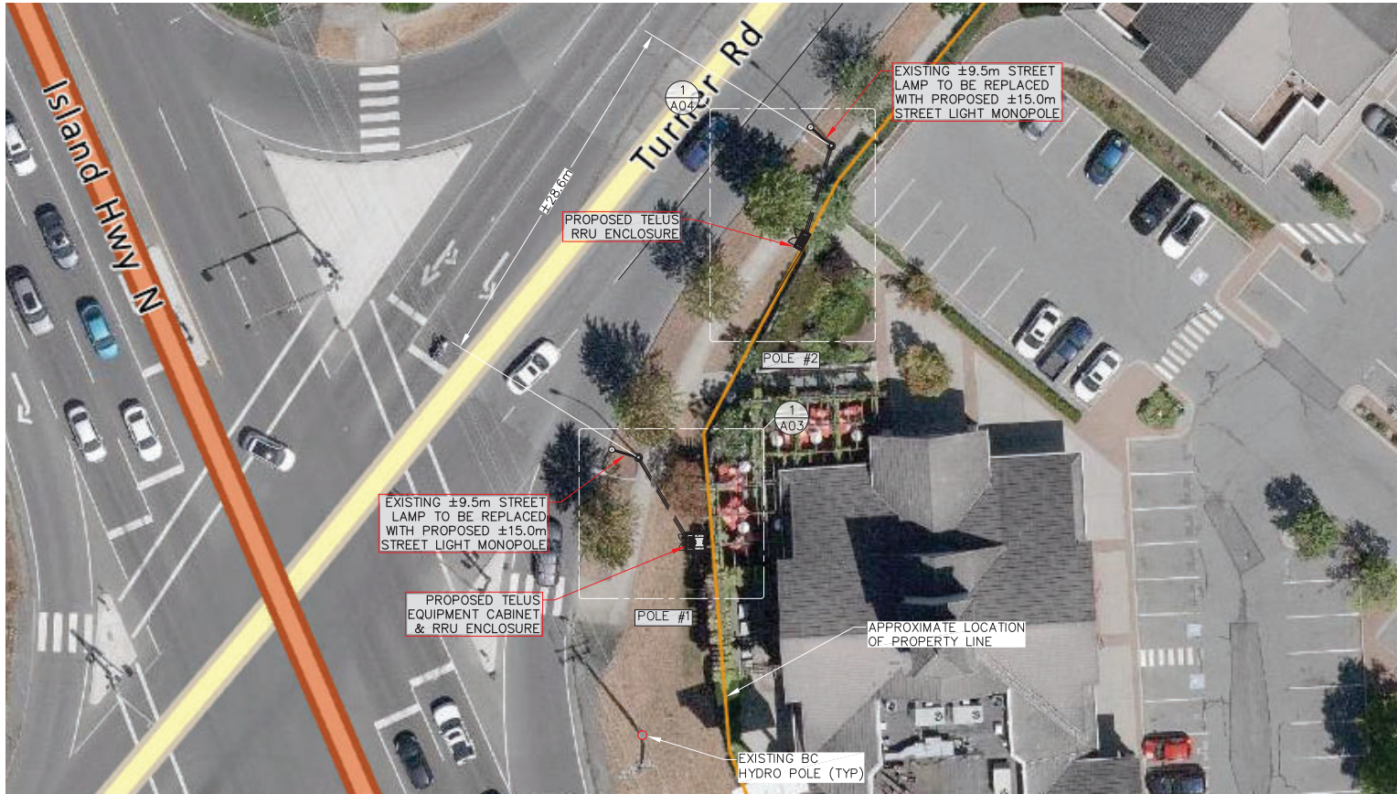
1 SITE PLAN SCALE 1:350