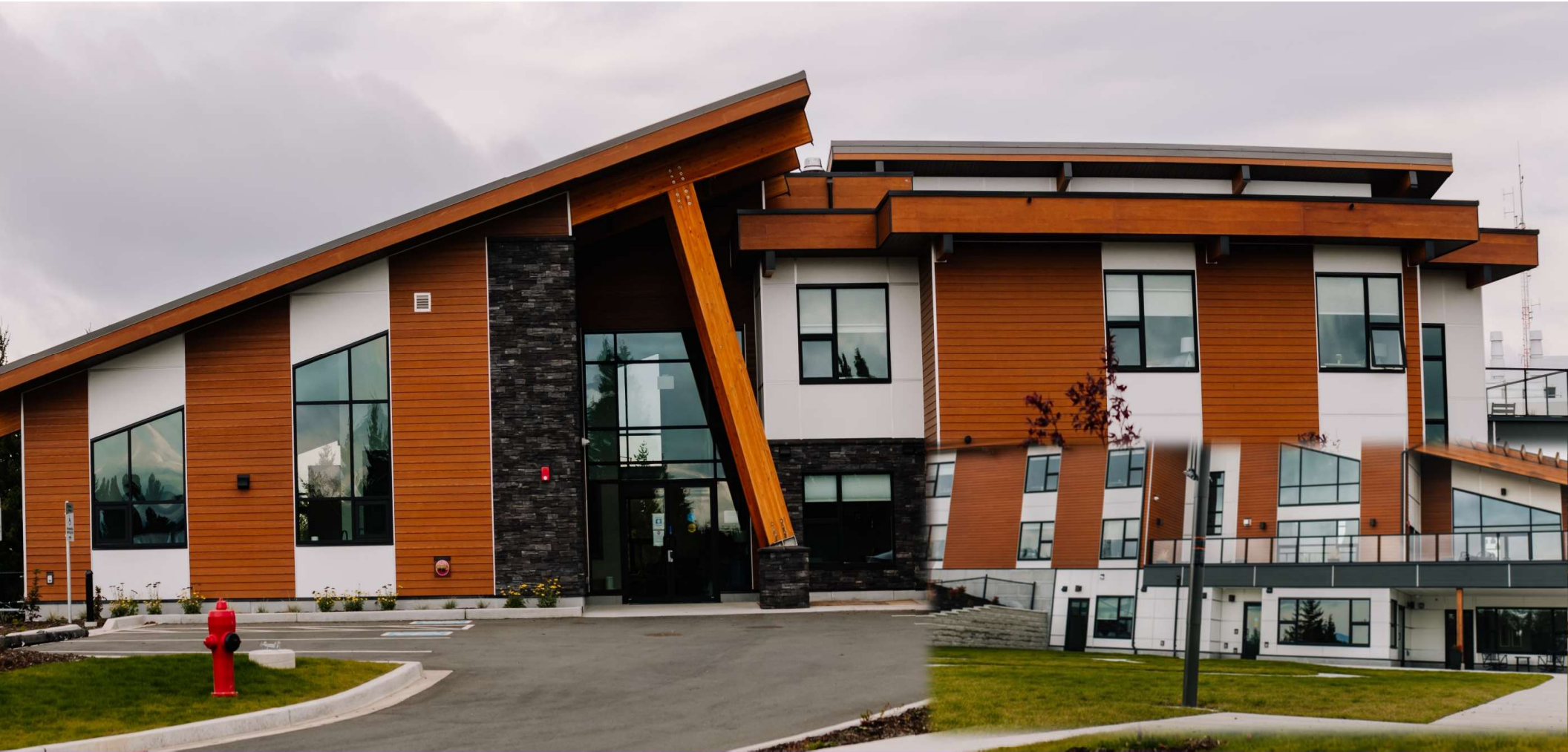
Qw'alyu House, Campbell River B.C.

children's HEALTH FOUNDATION OF VANCOUVER ISLAND