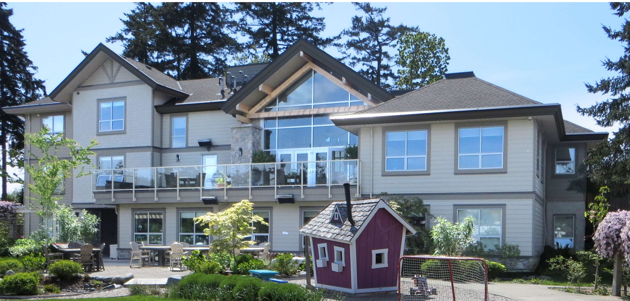
Jeneece Place, Victoria B.C.

children's HEALTH FOUNDATION OF VANCOUVER ISLAND