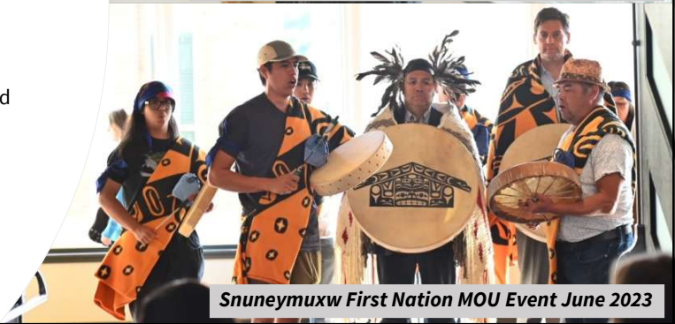
Snuneymuxw First Nation MOU Event June 2023