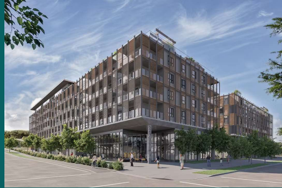
564 Fifth Street, 502 and 505 Howard Avenue (Te'tuxwtun)