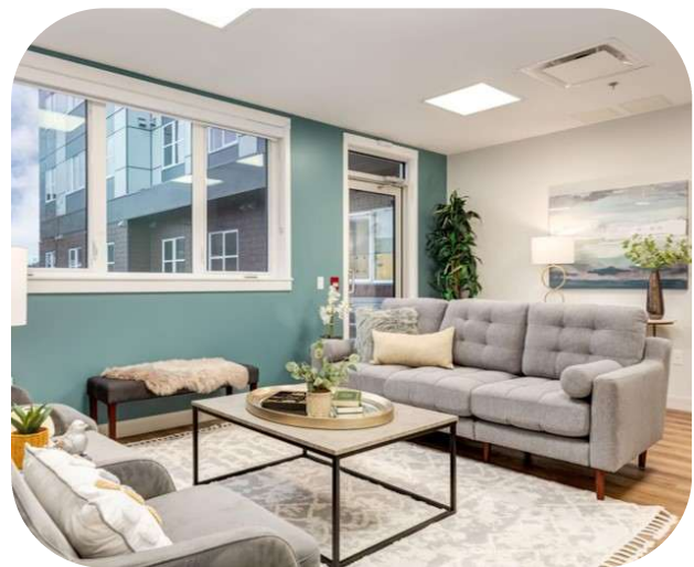
Haven Society Women's Housing (Reception and Intake Area) Complimentary staging by Chrysalis Home Staging as a gift to Haven.