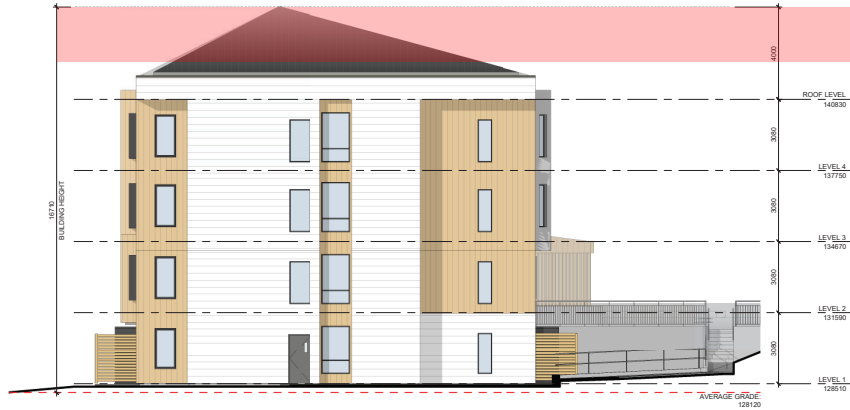
2 D07 ELEVATION - EAST D12 1:100