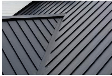
METAL STANDING SEAM ROOF