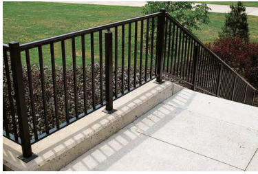
CHARCOAL ALUMINUM GUARD