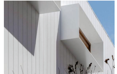
WHITE WINDOW SHROUD