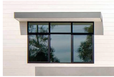
CHARCOAL VINYL WINDOW FRAME