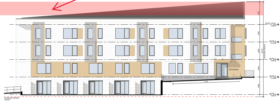
1 D07 ELEVATION - NORTH D12 1:100