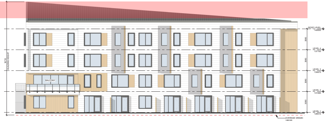
3 D07 ELEVATION - SOUTH D12 1:100