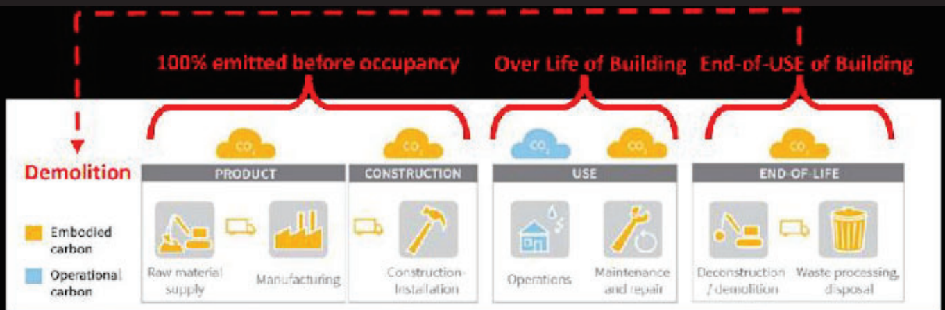
Embodied carbon and operational carbon across the key life stages of a building. CLF