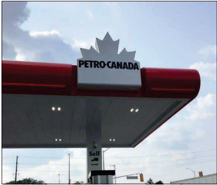
NEW ICON ASSEMBLY

AREA OF LOGOS: 38.7 SQ FT OR 3.6m WEIGHT: 265LBS OR 120kg