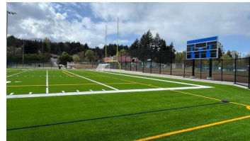
Harewood Artificial Turf Fields