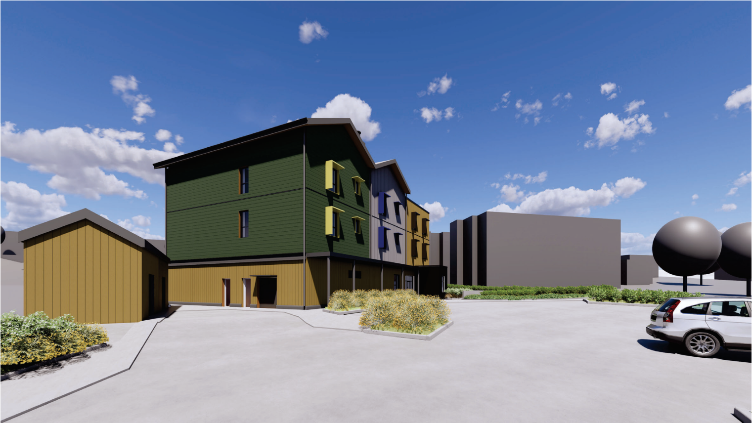
Front View from Boxwood Road

RECEIVED DP1379 2025-JUN-06 Current Planning