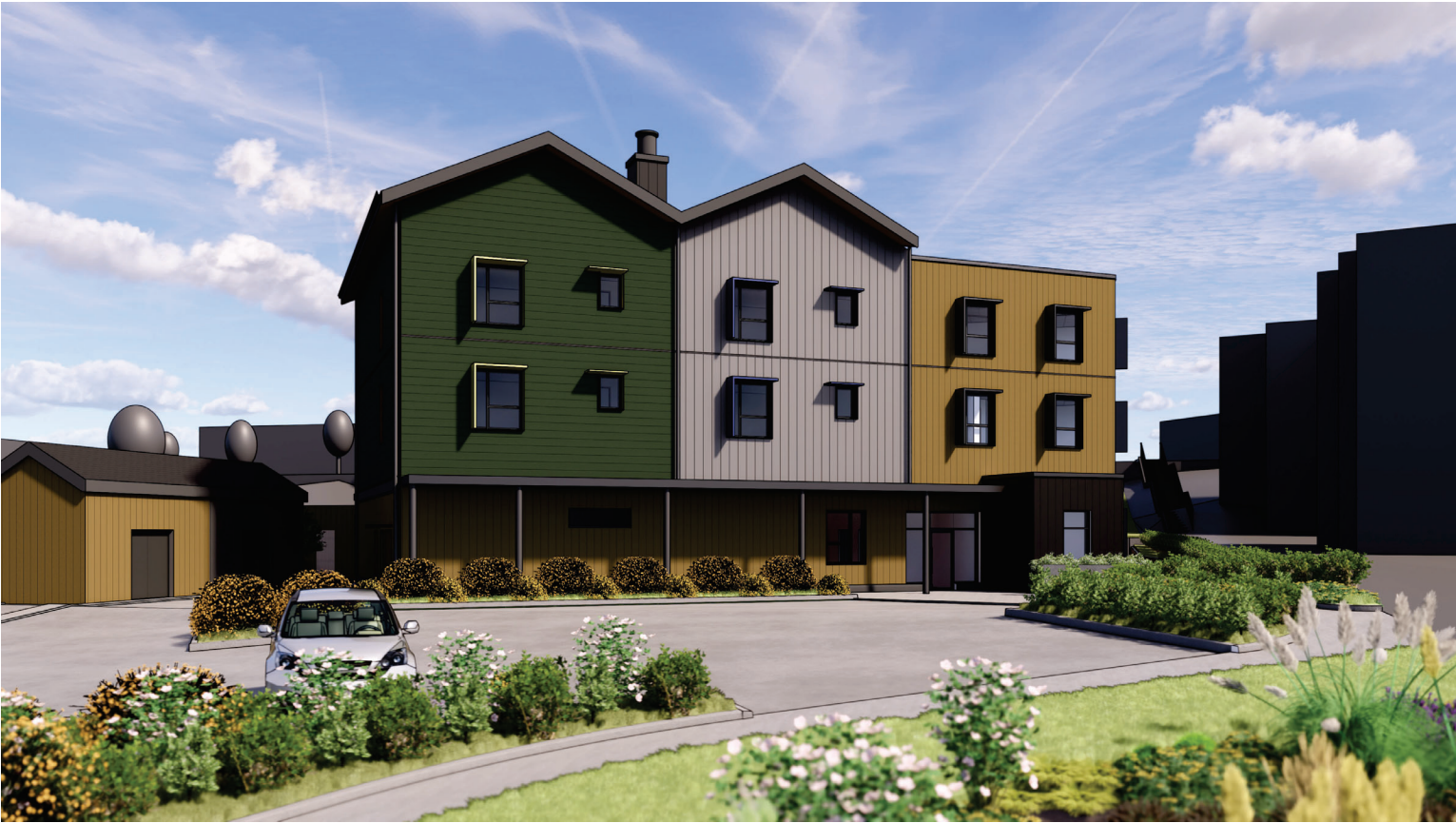
Front Entrance View