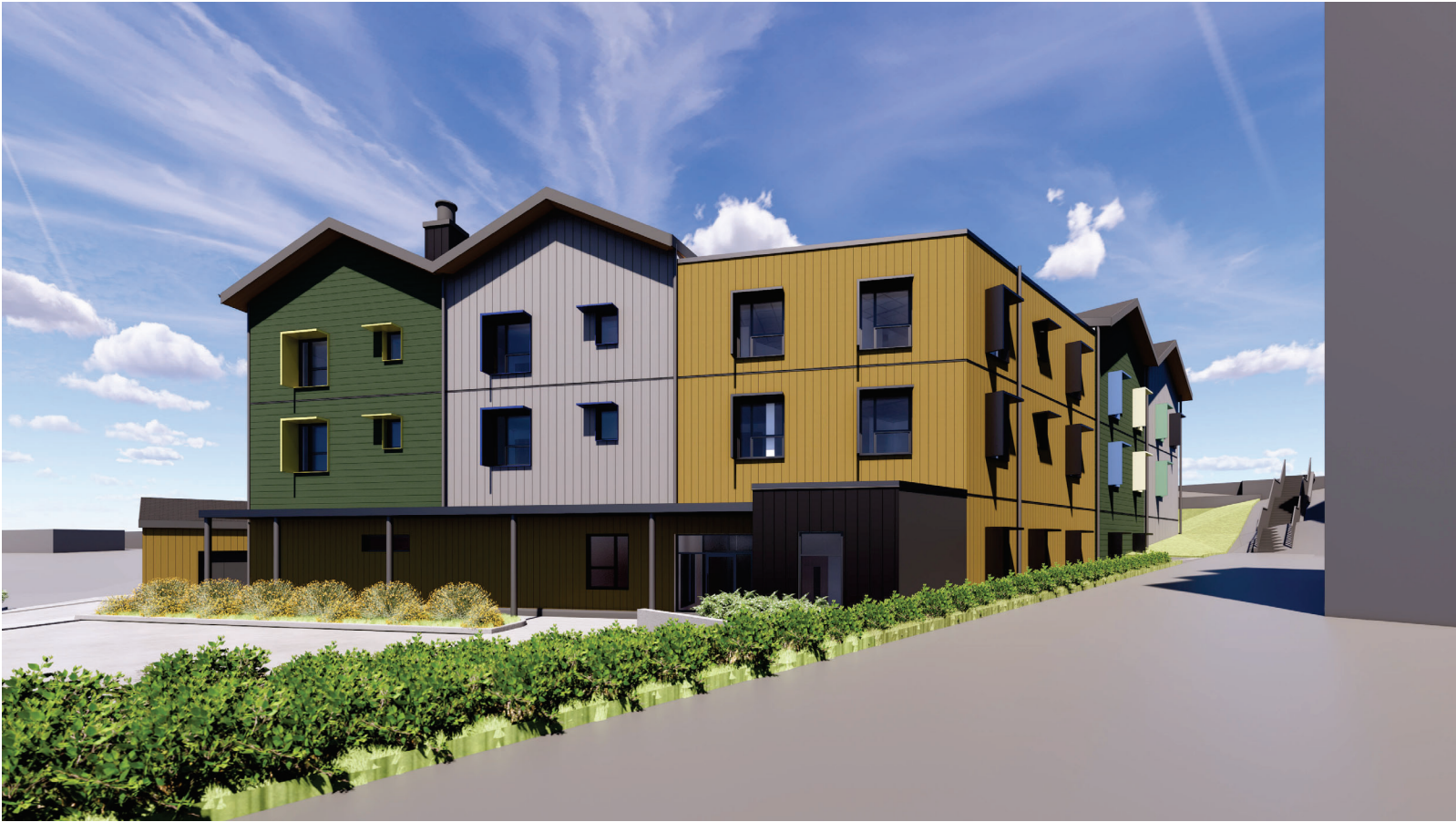
View from Pedestrian Pathway

All drawings and related documents are the property of Ryder Architecture (Canada) Inc. and may not be reproduced or used in part without written permission. Drawings are based upon the information provided by third parties and accuracy cannot be guaranteed. Do not scale this drawing. Do not use this drawing to calculate areas. Drawings to be verified by the Contractor and such dimensions to be scaled from responsibility. Work must comply with the relevant Building Codes, By Laws and related documents. Drawing errors and omissions must be reported immediately to the Architect's Office.