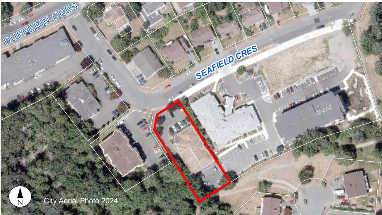
City Aerial Photo 2024