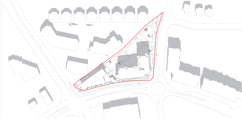
Equinox - March and September 12pm