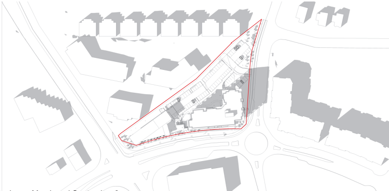
Equinox - March and September 3pm