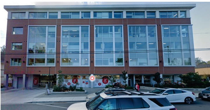
4 - VIEW OF NEIGHBOURING BUILDINGS ALONG DUFFERIN CRESCENT