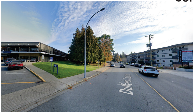
1 - VIEW ALONG DUFFERIN CRESCENT LOOKING AT PROJECT SITE