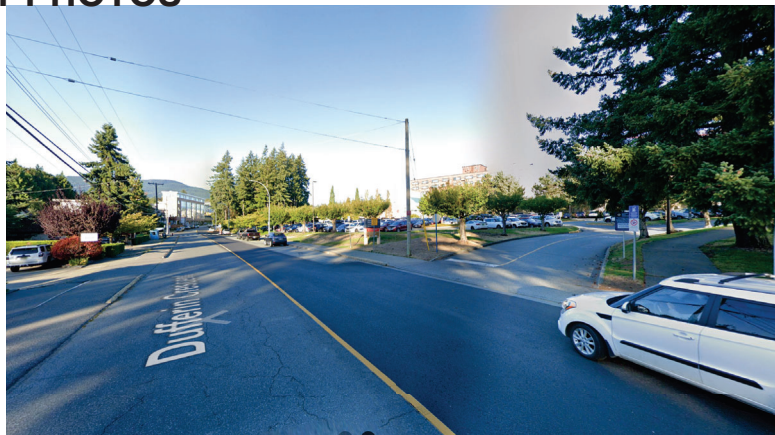
2 - VIEW ALONG DUFFERIN CRESCENT LOOKING AT PROJECT SITE