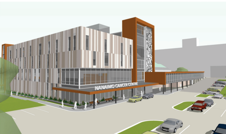
5 - RENDERING OF NEW NANAIMO CANCER CENTRE

RECEIVED DVP473 2024-NOV-26 Current Planning