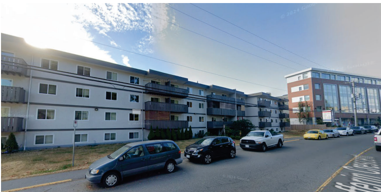
3 - VIEW OF NEIGHBOURING BUILDINGS ALONG DUFFERIN CRESCENT