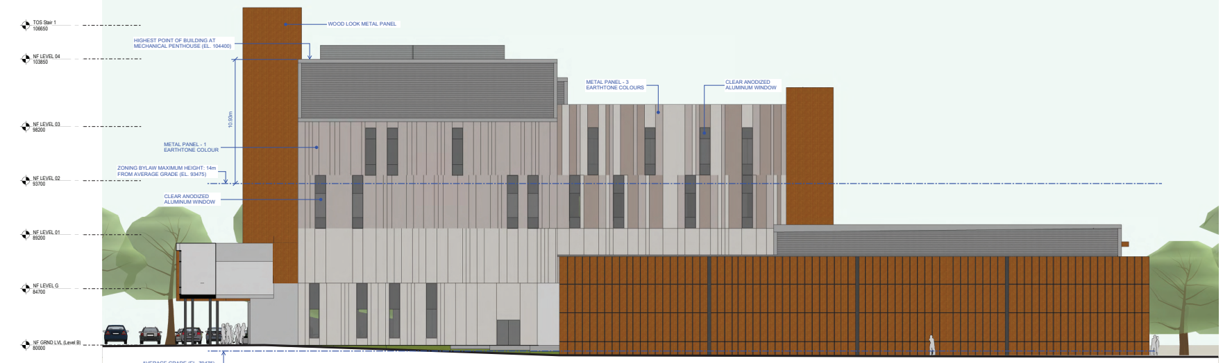
2 NORTH ELEVATION 1:100

RECEIVED DVP473 2024-NOV-26 Current Planning