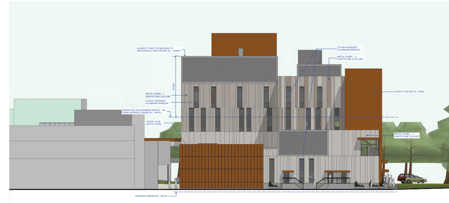
2 WEST ELEVATION 1:100