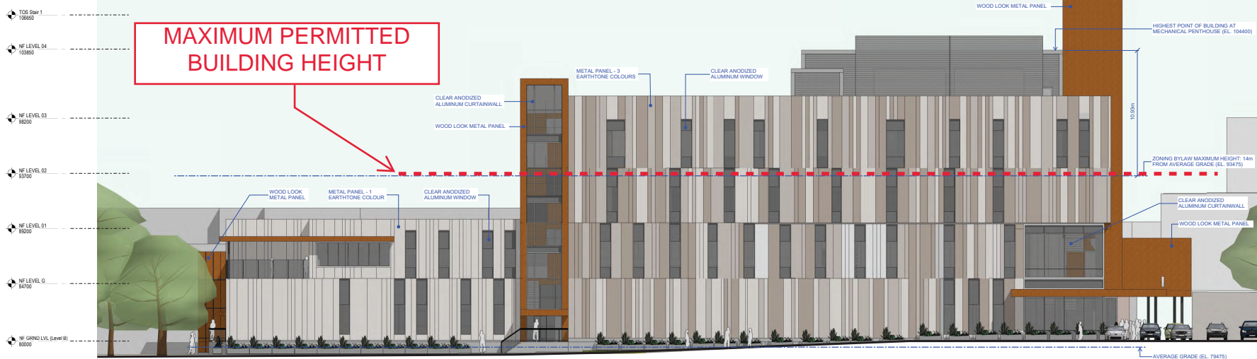
1 SOUTH ELEVATION 1:100 (FACING DUFFERIN CRESCENT)