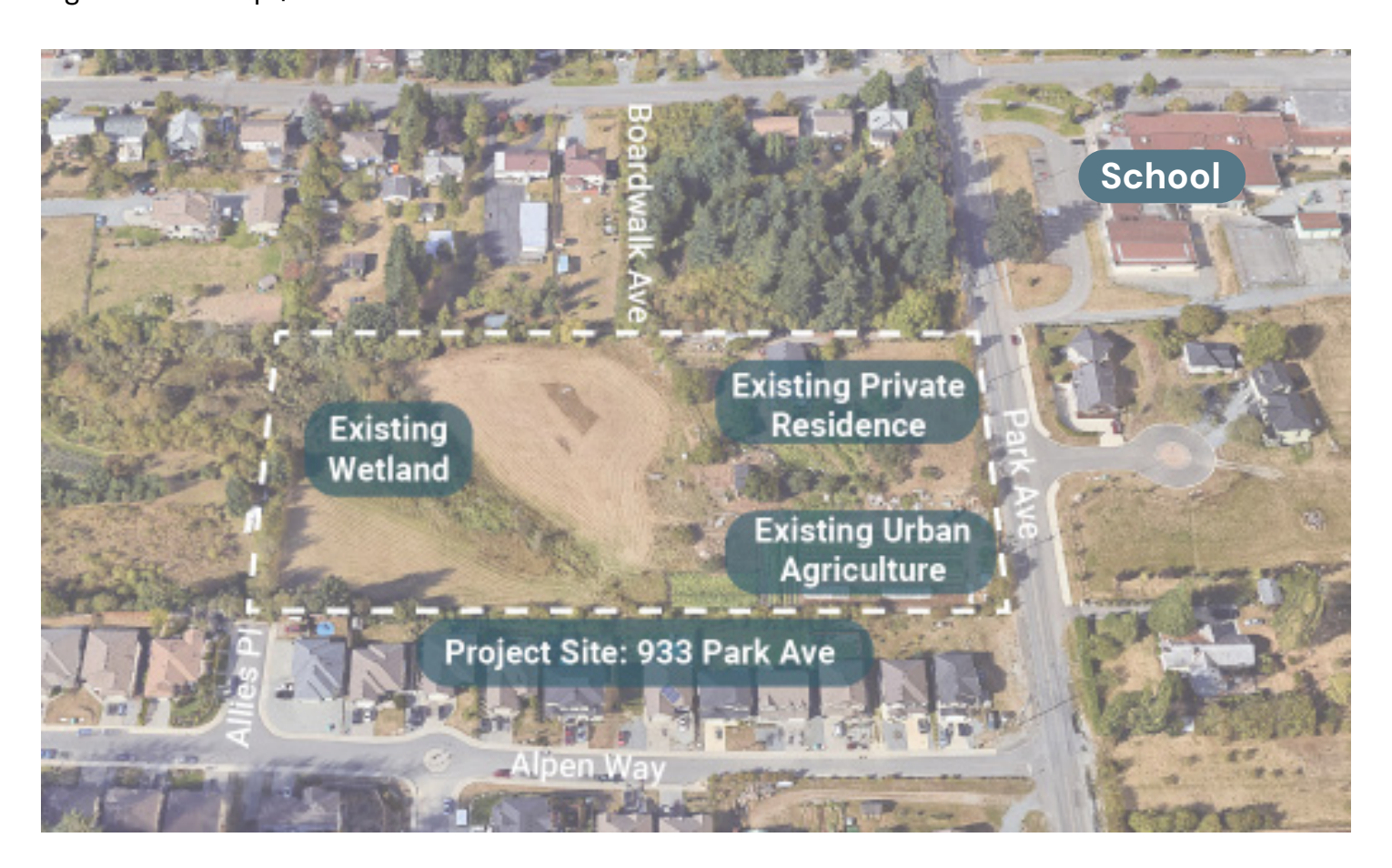
Figure 1: Site Map | 933 Park Avenue

The property at 933 Park Avenue (see Figure 1) is located in the Harewood neighbourhood, and has an area of ~20,221 m<sup>2</sup>. The neighbourhood is comprised of ground-oriented residential homes and an elementary school to the northeast.