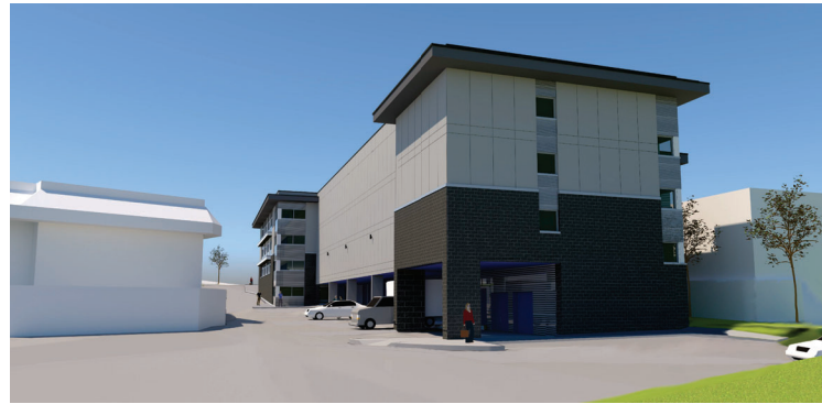
4 VIEW FROM NORTH-EAST