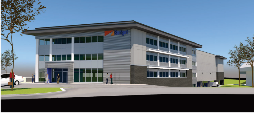
1 VIEW FROM SOUTH-WEST (FACING ISLAND HIGHWAY)