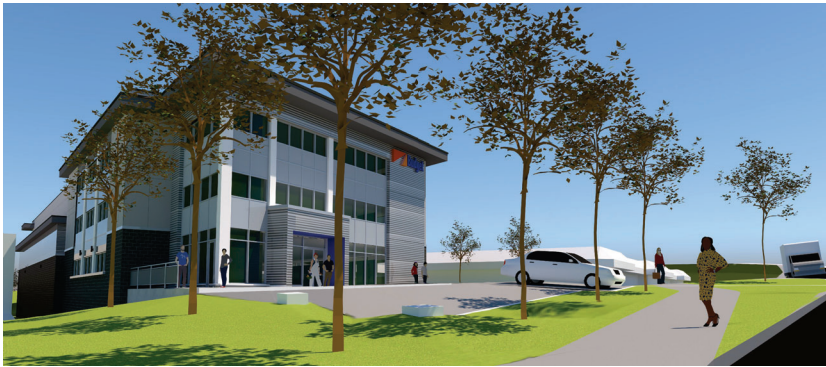
3 VIEW FROM NORTH-WEST