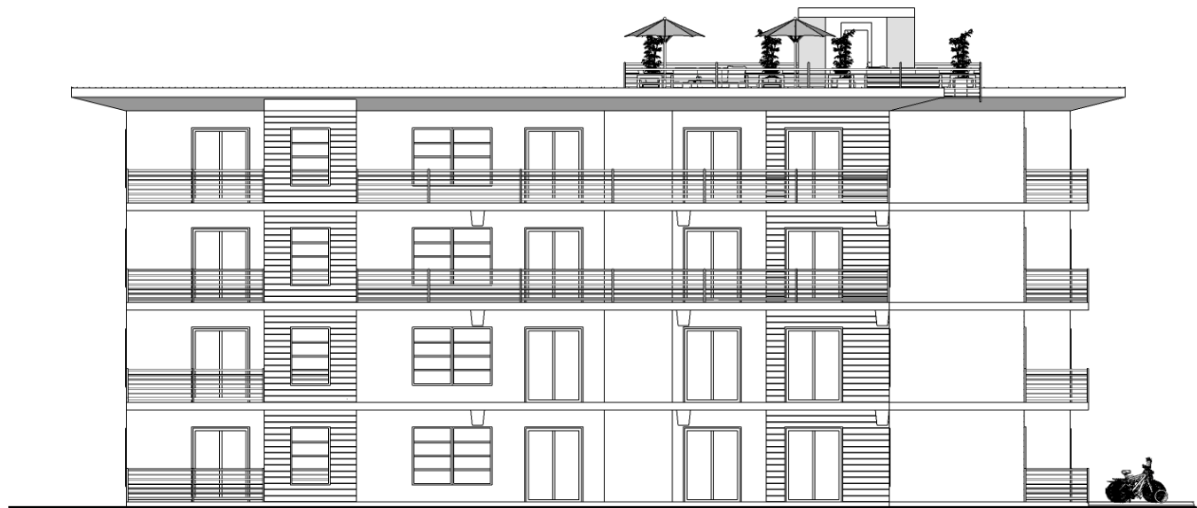
VIEW FROM THIRD STREET