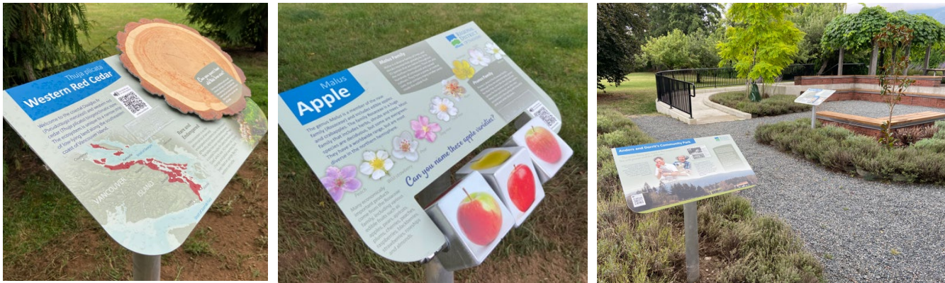
New interpretive signage

New interpretive signage has been installed to provide information to park visitors about the history and unique tree species in the park.