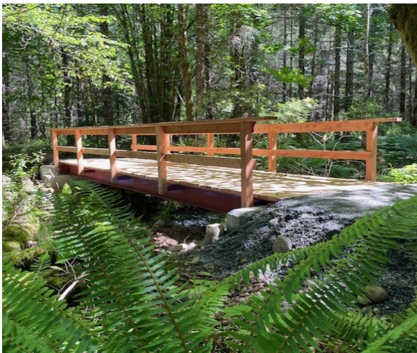
New bridge on Clay Banks Trail

The bridge over the side channel on the Clay Banks Trail was replaced.