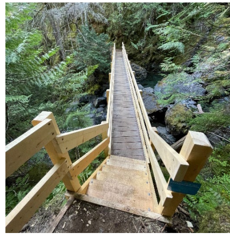
New handrail and steps on bridge