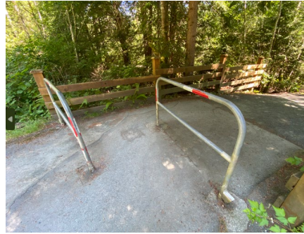
Baffles to be spaced further apart