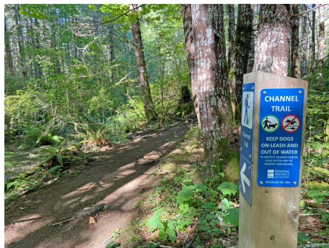
New signage on Channel Trail