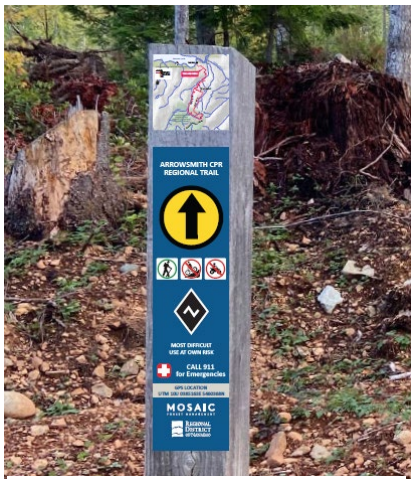
Renderings of new trail signage

A new handrail and steps were installed on the McBey Creek pedestrian bridge.