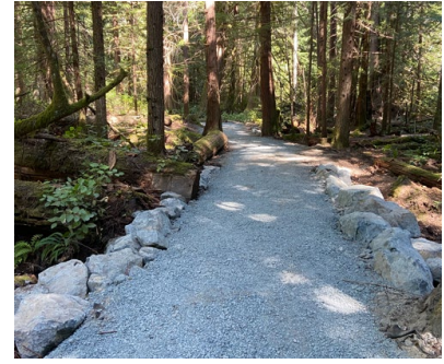
New surfacing on trail