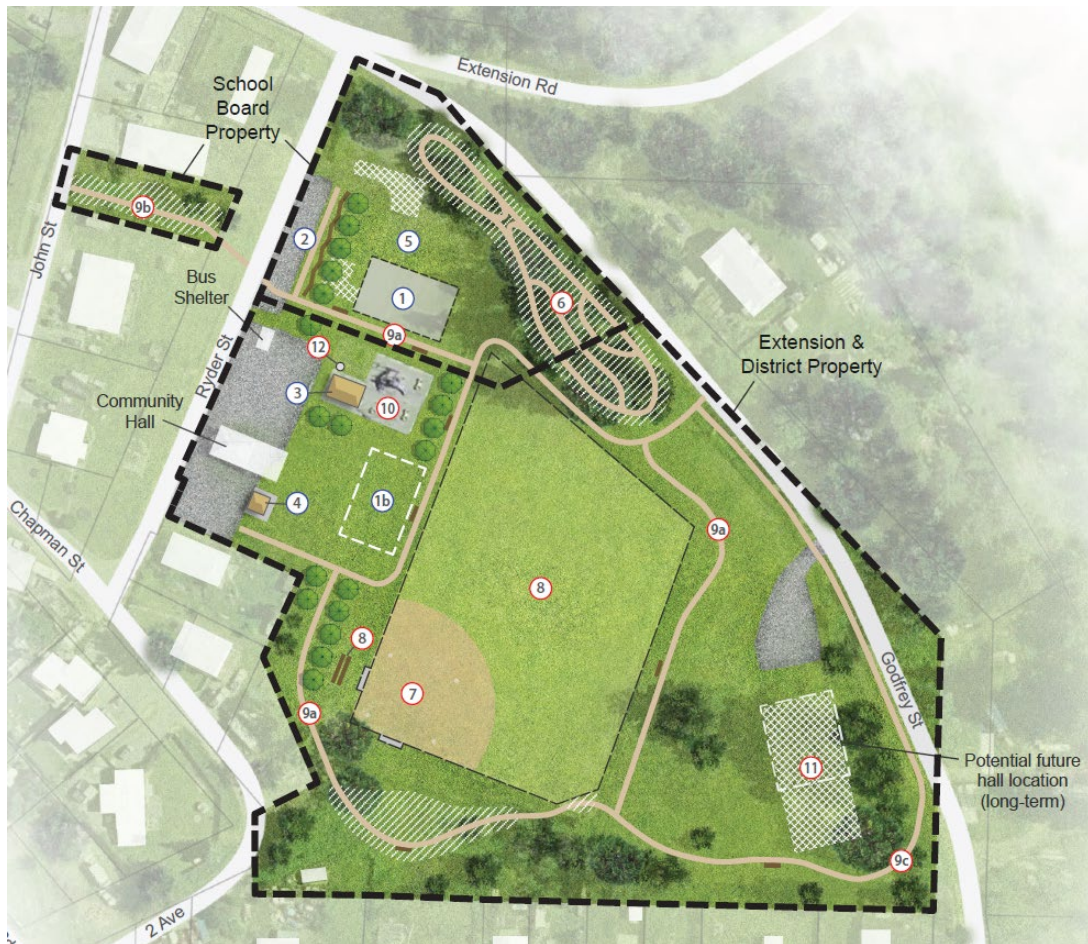
Proposed Concept Plan