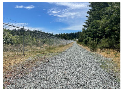
Photos of new trailhead and trail reroute through the City of Parksville right-of-way