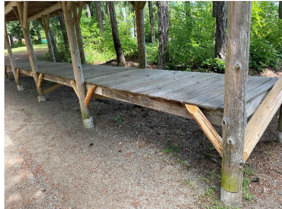
Photos of new reinforcements of the Errington Community Park pavilion and market stalls