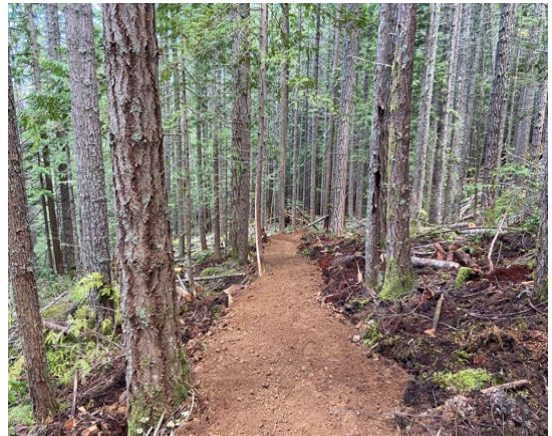
New trail reroute.

Building permit applications are underway to install two trailhead kiosk signs where Benson View Regional Trail intersects with Outer Bypass and Gail's Trail.