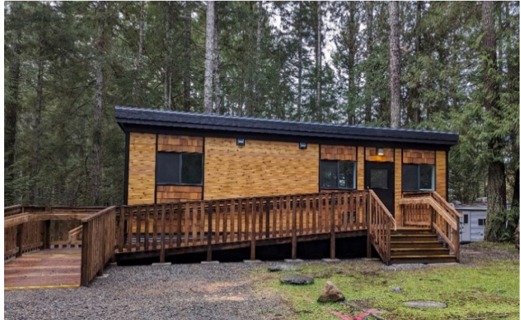
New prefabricated campground office building at Descanso Bay Regional Park.

Additional site upgrades completed in Q2 2024 include improving the gravel paths around the new office, installation of a privacy fence for the campground operator, and providing new cedar planters and picnic tables to further enhance the park entrance.