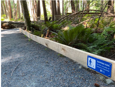
New tap rail

Sections of the south loop of the trail have been resurfaced and some of the small bridges are being replaced with culverts to improve maintenance access. The tap rail for visually impaired visitors has been replaced. Baffle barriers at the Lioness Boulevard railway crossing will be spaced further apart to improve accessibility for mobility scooters, wheelchairs, strollers and bicycles.