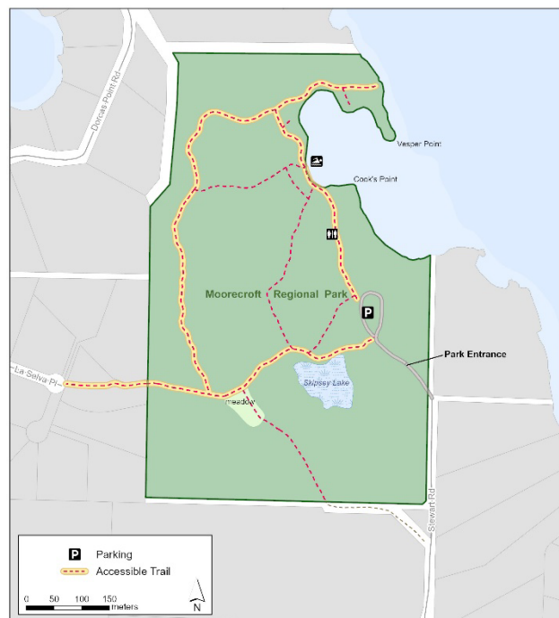
Map of accessible trail within park