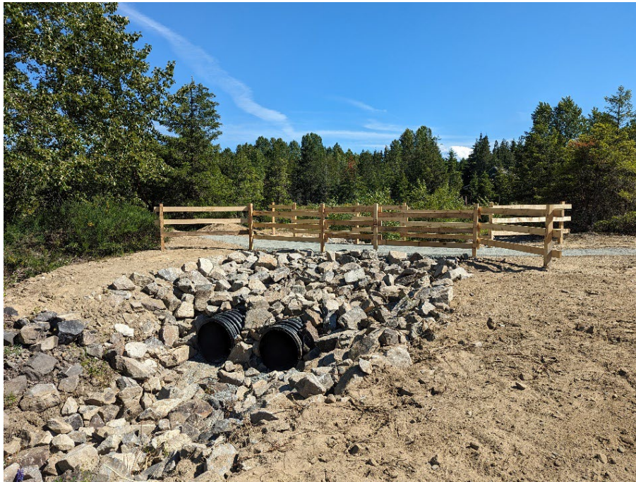
Photo of new culvert and trail crossing in Stormwater Community Park

Construction of a new roadside gravel trail along Kaye Road and Peterson Road, and a culvert and trail crossing in Stormwater Community Park were completed in Q2 2024. A landscape service contract has been retained for the maintenance of the trail network.