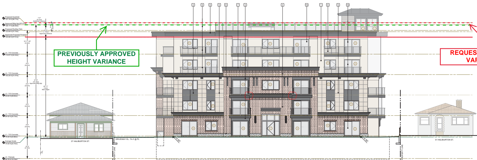
1 WEST ELEVATION SCALE: 1/8 = 1'-0"

This drawing and design are and shall at all times remain the exclusive property of Matthew T. Hansen Architect and cannot be used or reproduced without written consent. Where dimensions shall have precedence over scaled dimensions. Contractor shall verify and shall be responsible for all dimensions and conditions on the job and the Architect shall be informed of any variations from the dimensions and conditions as shown on this drawing.