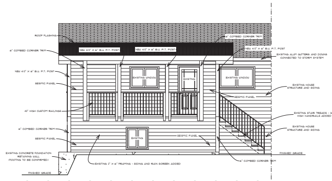
REAR (WEST) ELEVATION 1/4" = 1'-0"