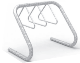
EXAMPLE OF EXTERIOR BIKE RACK