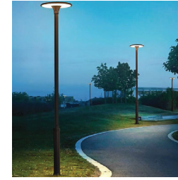
EXAMPLE OF EXTERIOR LAMP POSTS (REFER TO ELEC. FOR FIXTURE TYPE)