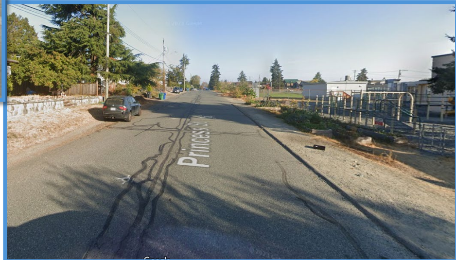
Bayview Elementary School