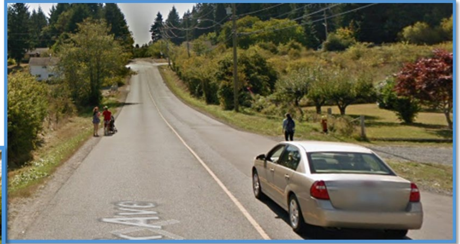
Park Avenue Elementary School