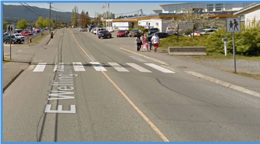
École Quaterway Elementary School