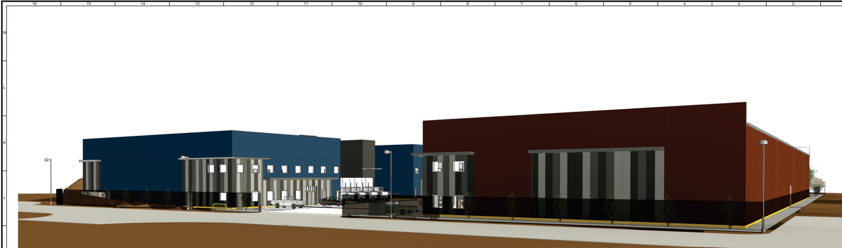
1 | 3D View 3