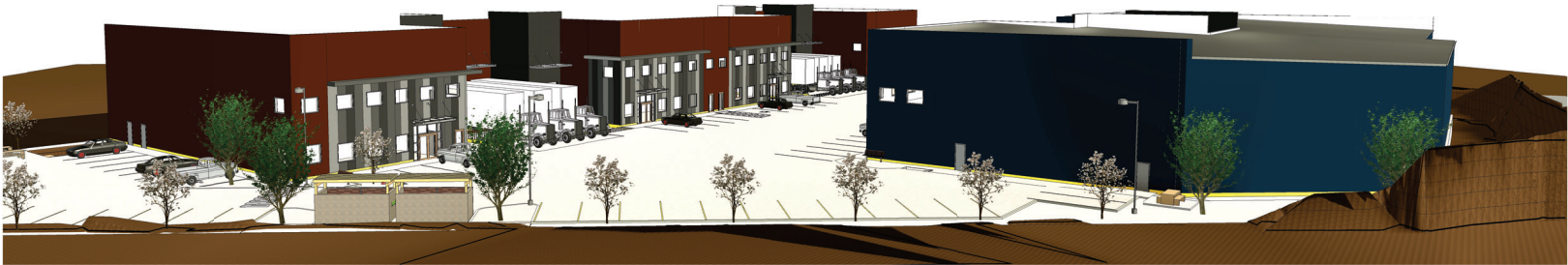
2 | 3D View 4