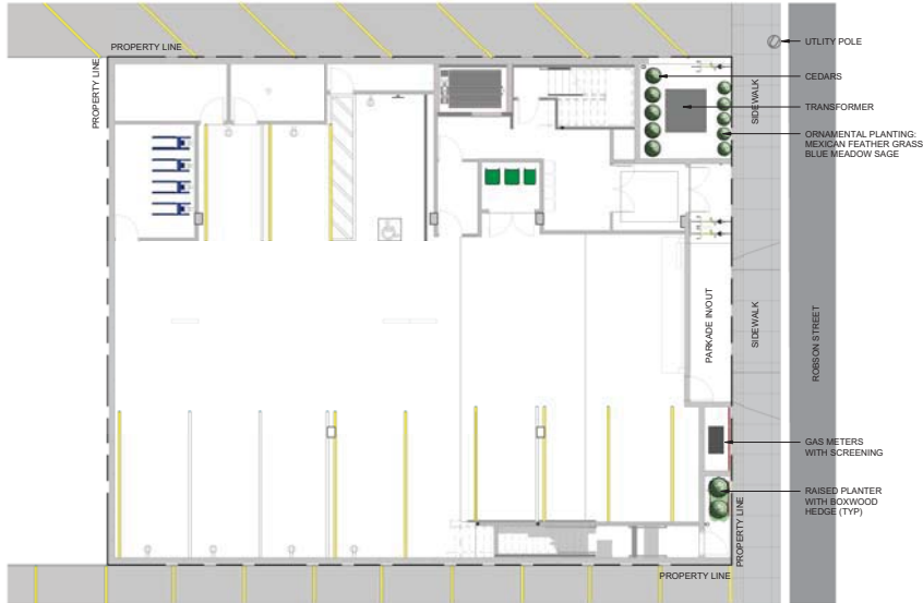
LANDSCAPE PLAN - LEVEL 1 1:100

AT THE STREET LEVEL, THE DEVELOPMENT OFFERS A COVERED ENTRYWAY AND BICYCLE PARKING OFF OF ROBSON STREET. PARKADE ACCESS IS LOCATED CENTRALLY WITH REQUIRED MECHANICAL ELEMENTS FLANKING EACH SIDE. PLANTERS AND SCONCE LIGHTING PLACED FOR EACH BUILDING ACCESS POINTS. MECHANICAL ELEMENTS ARE SOFTENED/SCREENED WITH THE USE OF CEDARS AND METAL SCREENING.