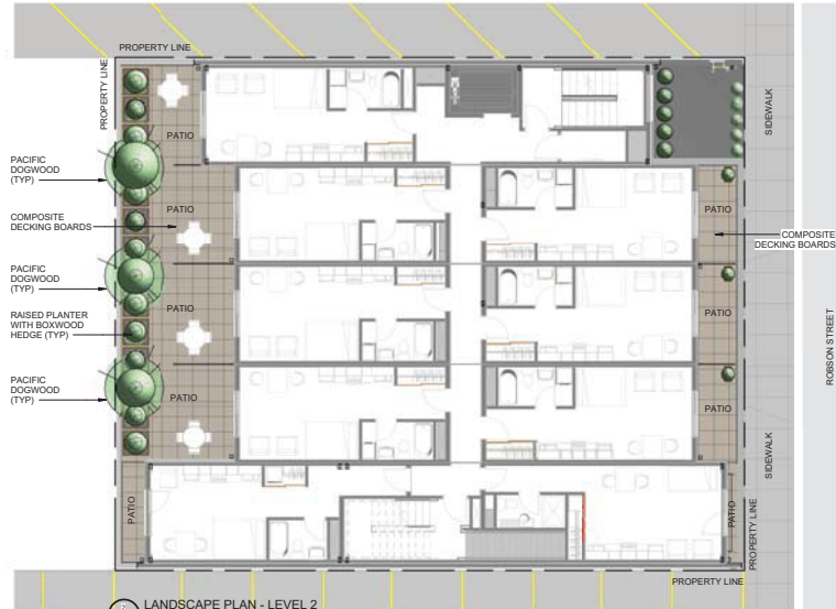
LANDSCAPE PLAN - LEVEL 2 1:100

LEVEL TWO OFFERS PRIVATE PATIOS FOR RESIDENTS. ON THE SOUTHWEST SIDE OF THE BUILDING, A BOXWOOD HEDGE AND DOGWOOD TREES WITHIN RAISED PLANTERS PROVIDE ALL SEASON PRIVACY FOR RESIDENTS. THE PLANT MATERIAL WORKS TO SOFTEN THE BUILDING EDGE WHEN VIEWED FROM STREET LEVEL AND FROM ADJACENT BUILDINGS. IN THE SPRING, FLOWERS ON THE DOGWOODS ATTRACT POLLINATORS. DURING THE WINTER, THE DOGWOODS BRANCHING CREATES AN INTERESTING FORM WITHIN THE LANDSCAPE.