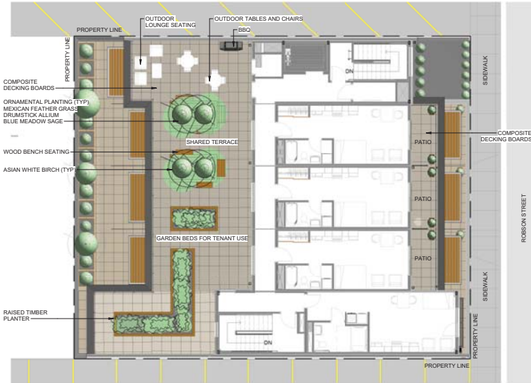
LANDSCAPE PLAN - LEVEL 5 1:100