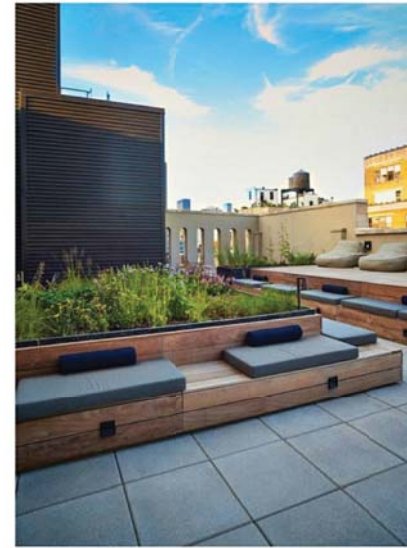
BENCH SEATING AROUND PLANTERS