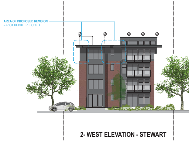
2- WEST ELEVATION - STEWART