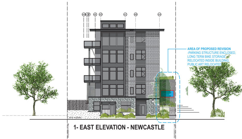
1- EAST ELEVATION - NEWCASTLE