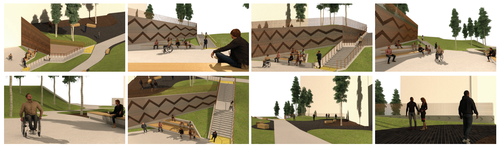
2 Perspectives - Various showing form and character of wall, stair, and guard rail Scale: NTS