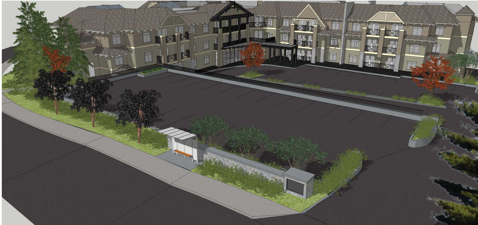
BERWICK ON THE LAKE ADDITIONAL PARKING RENOVATIONS DEVELOPMENT PERMIT