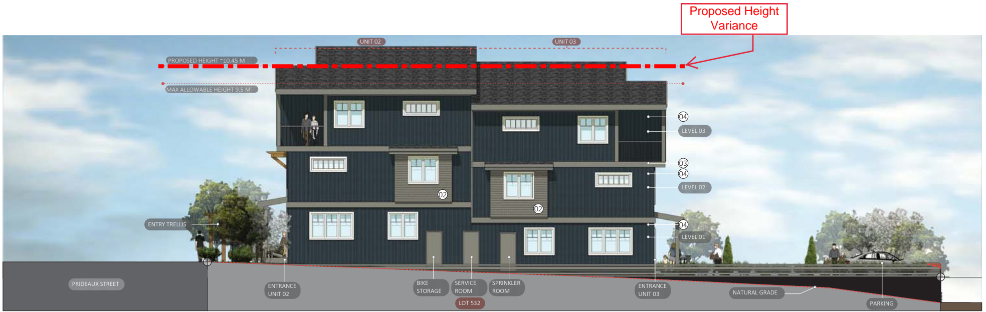
EAST ELEVATION | FOURPLEX | SIDE ELEVATION | Scale 1/8" = 1' |