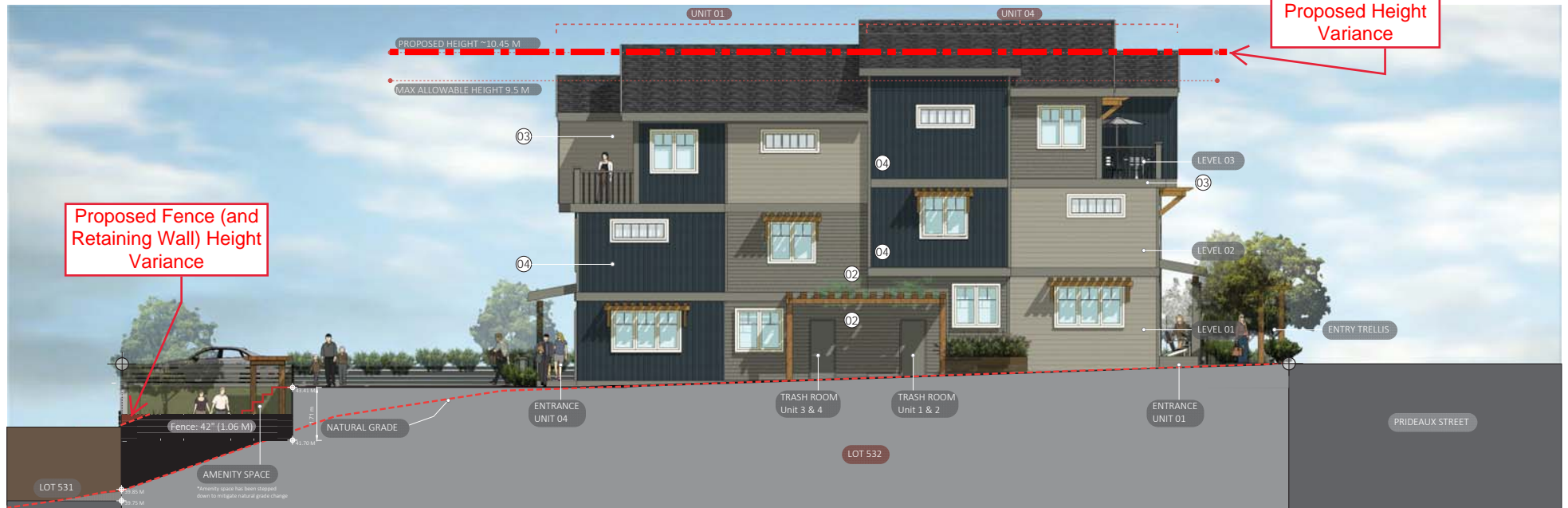
WEST ELEVATION | FOURPLEX | SIDE ELEVATION | Scale 1/8" = 1' |