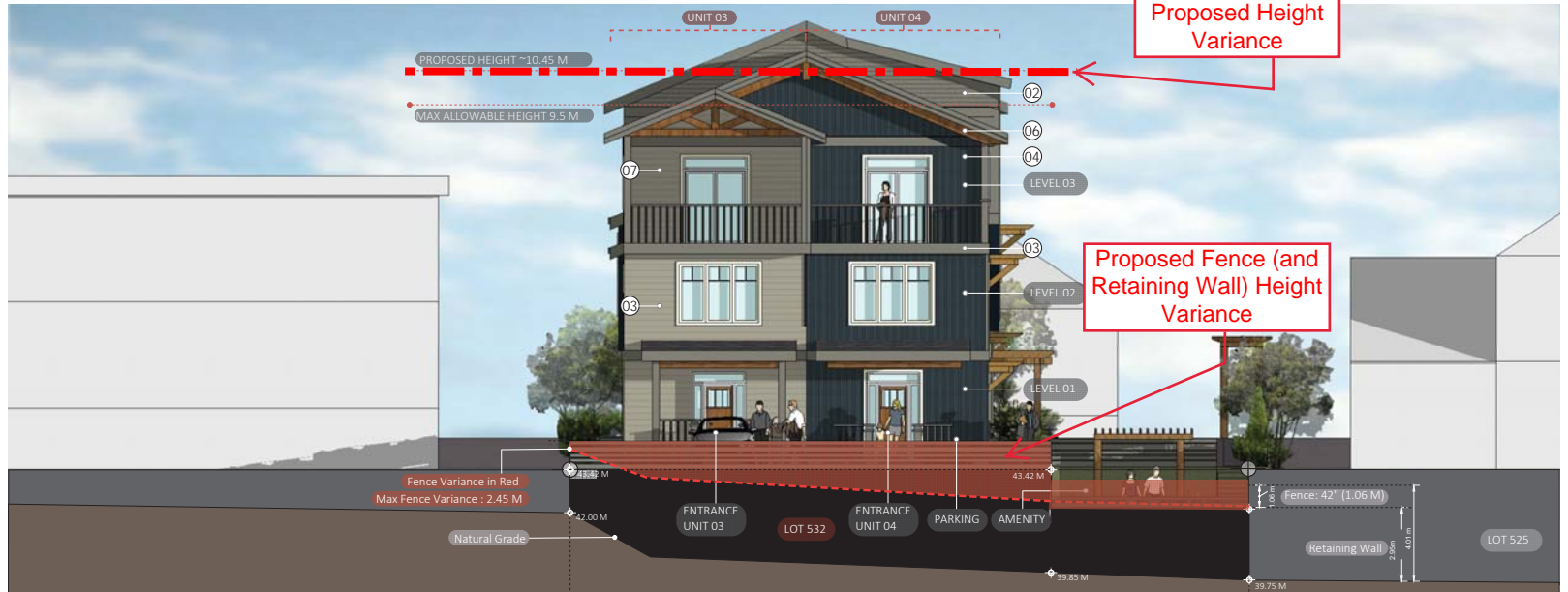
NORTH ELEVATION | FOURPLEX | FROM REAR | Scale 1/8" = 1' |