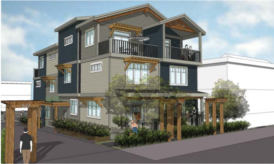
FRONT VIEW FROM PRIDEAUX STREET