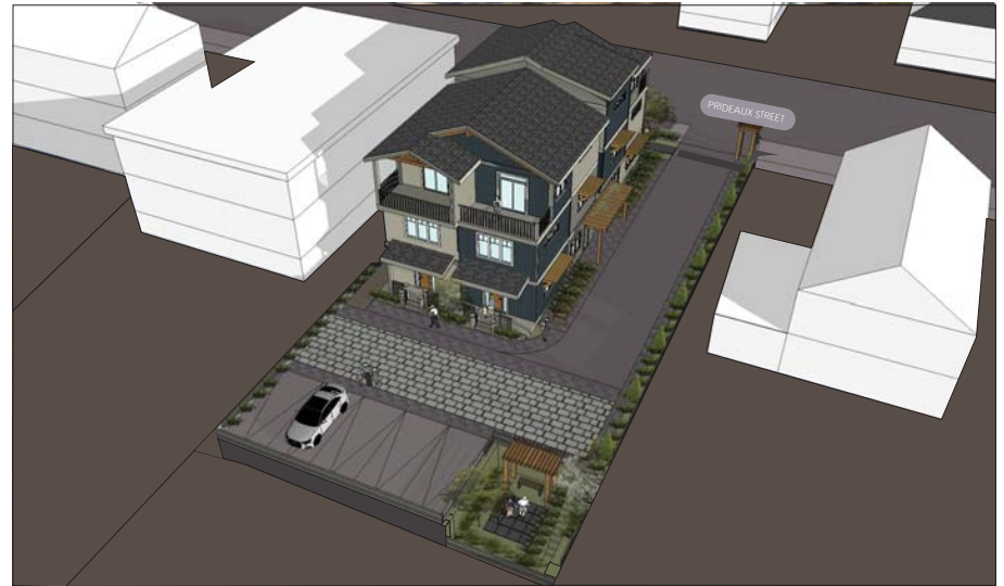
AERIAL VIEW OF SITE (REAR)