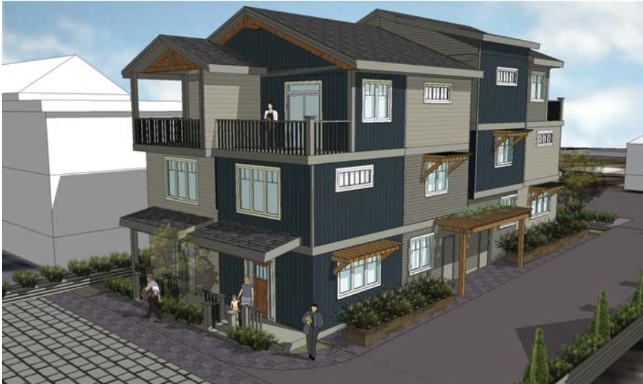
REAR VIEW OF BUILDING