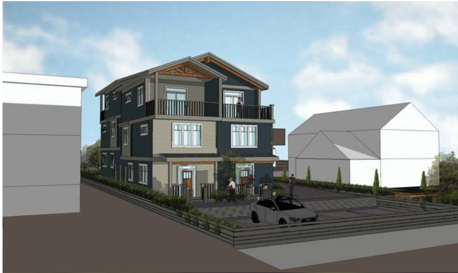
REAR VIEW OF PARKING AREA