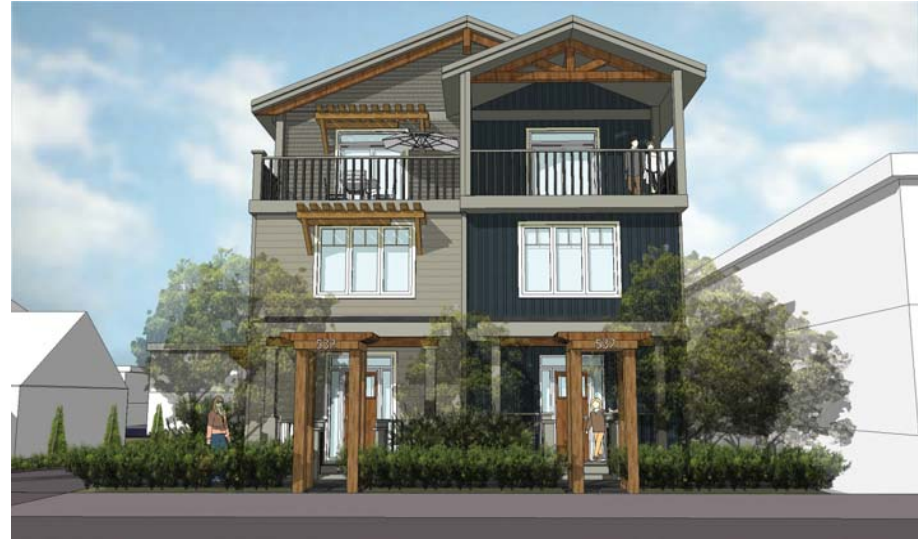
FRONT VIEW FROM PRIDEAUX STREET