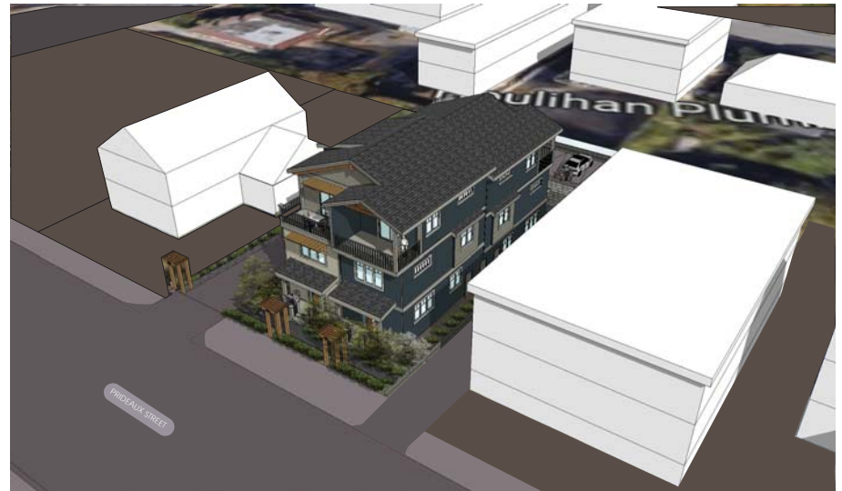
STREET VIEW OF BUILDING FROM PRIDEAUX