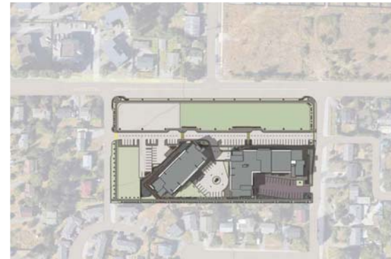
UTC -08:00 Harbour Hills, Nanaimo, BC; 21st June 03PM