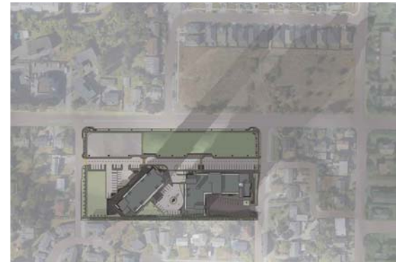
UTC -08:00 Harbour Hills, Nanaimo, BC; 21st December 03PM