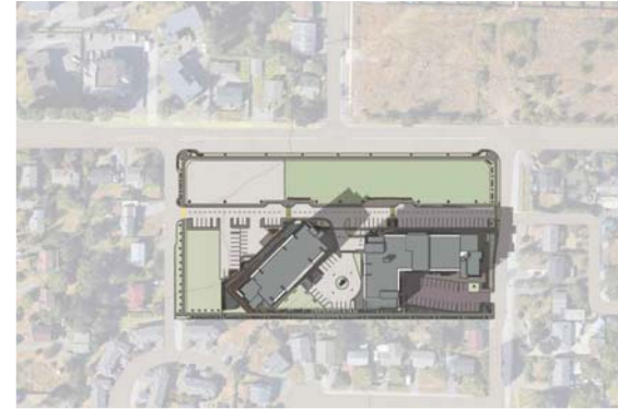
UTC -08:00 Harbour Hills, Nanaimo, BC; 22nd September 03PM