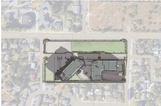
UTC -08:00 Harbour Hills, Nanaimo, BC; 22nd September 09AM