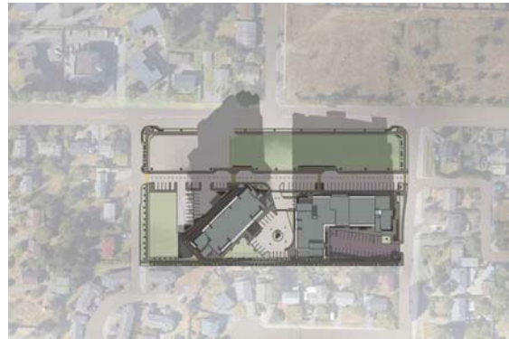
UTC -08:00 Harbour Hills, Nanaimo, BC; 21st December 12PM