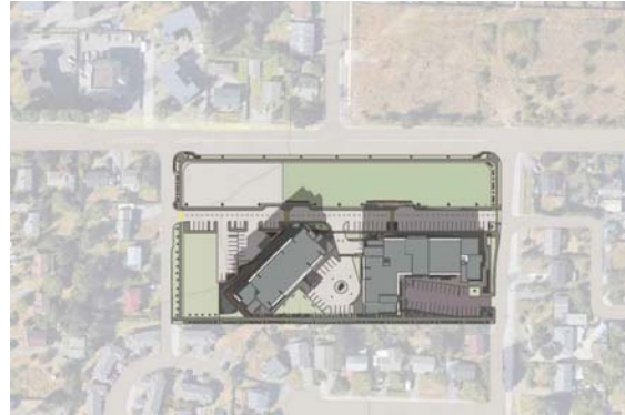
UTC -08:00 Harbour Hills, Nanaimo, BC; 22nd September 12PM