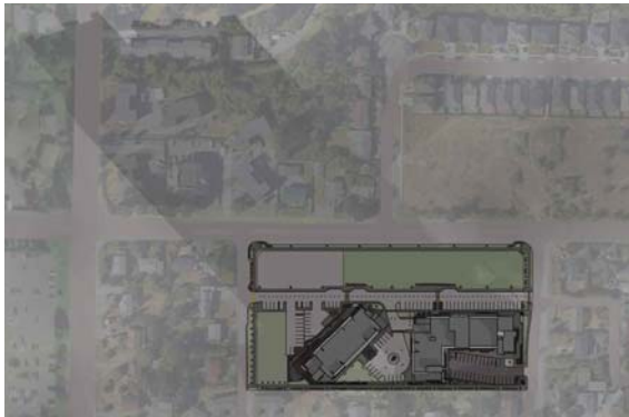
UTC -08:00 Harbour Hills, Nanaimo, BC; 21st December 09AM