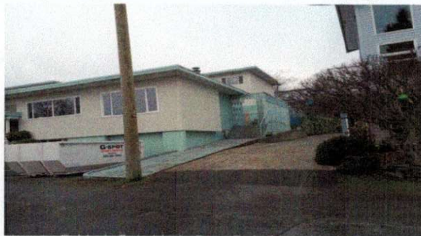
NORTH SIDE PRIOR TO BUILDING PERMIT