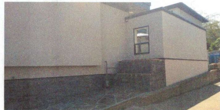
NORTH SIDE PRIVACY FENCE CONSTRUCTION NORTH ELVATION

RECEIVED DP1303 2023-AUG-29 Current Planning