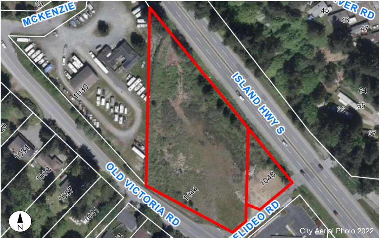
City Aerial Photo 2022