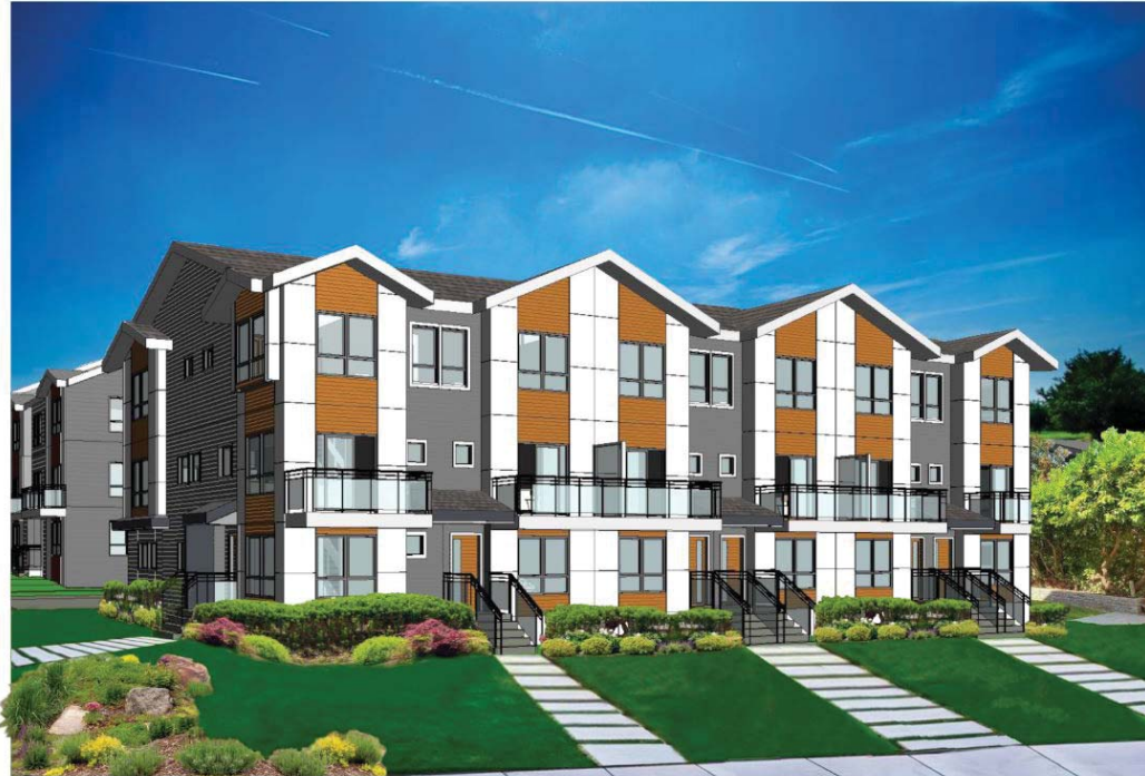
Exterior Perspective @ Labieux Road