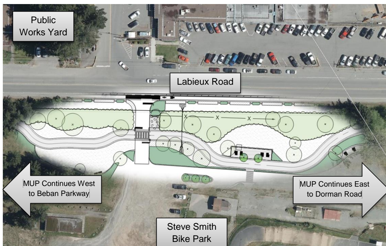
Figure 3: Beban Park Multi-Use Pathway Improvements West

The pathway would complete a circular route of trails through Beban Park. It will integrate existing park facilities throughout this area, including parking lots, cycling facilities, and the off-leash dog park, with the goal of enhancing user experiences and the level of accessibility for these facilities without impacting the space already allocated to them. Numerous pedestrian and active transportation connections to Labieux Road from the MUP will be established to facilitate flexible use of this amenity.