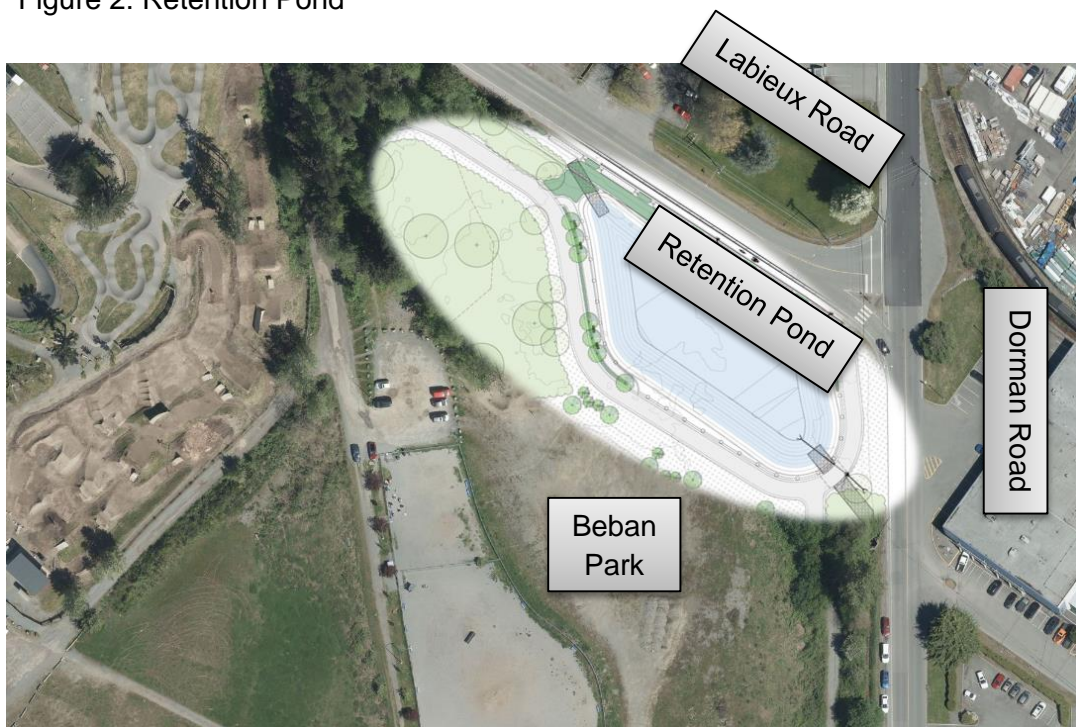
Figure 2: Retention Pond

Retention pond would be constructed to integrate and respect the natural aesthetic of the area, provide passive recreation opportunities, and limit stormwater flows to natural pre-development levels.