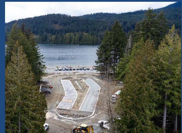
Westwood Lake Park improvements