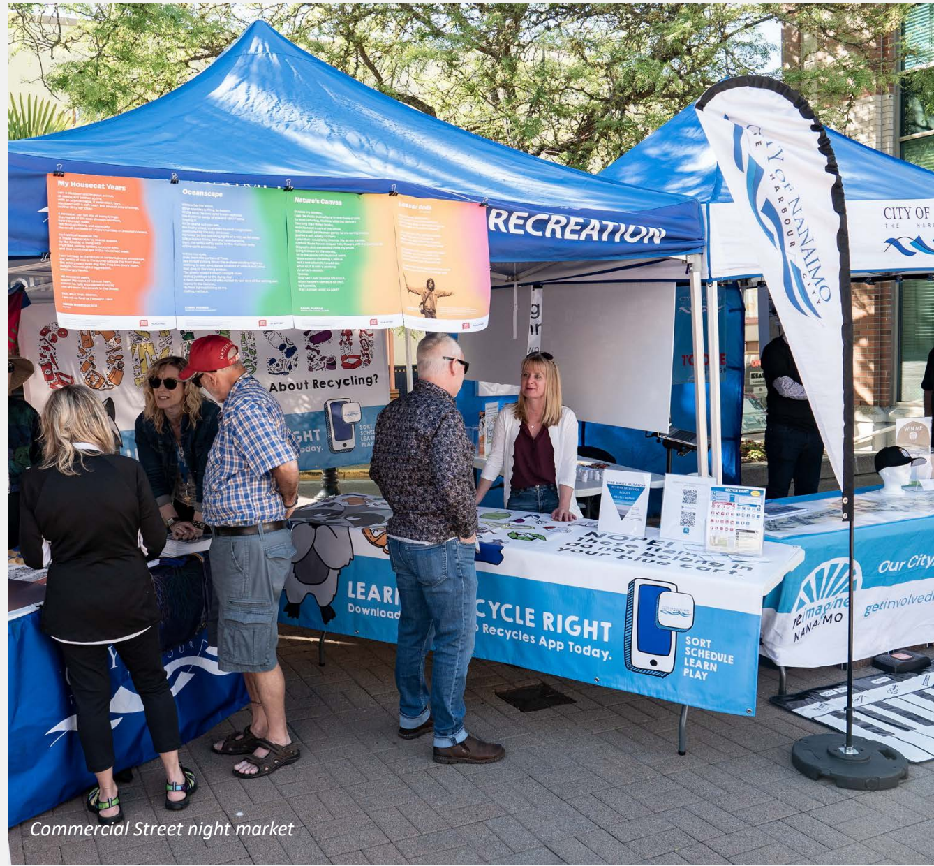
Commercial Street night market

We recognize that effective communication is essential to building a strong and vibrant community, and we are committed to this in all aspects of our work.