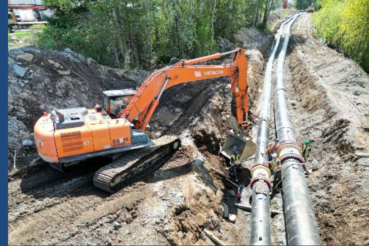
Midtown Water Supply Project

Over this term Council will ensure the City plans, maintains and grows these services as our population grows while ensuring we are fiscally responsible and responsive to the evolving needs of our community.