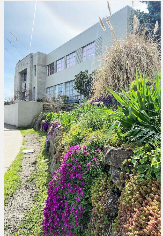
Nanaimo City Hall