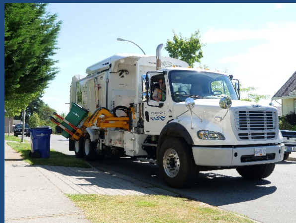
Automated garbage truck