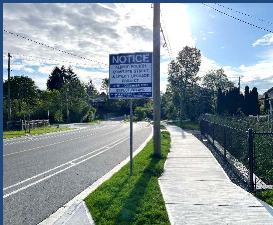
Fourth Street upgrades