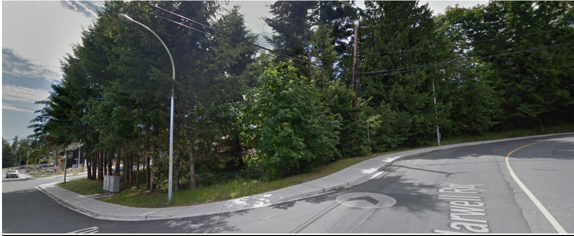
View of the park from Arbot and Harwell Rd