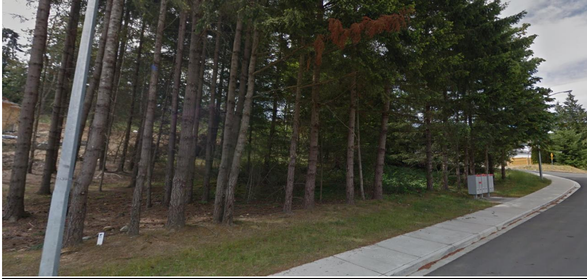
View of the park from Arbot Rd