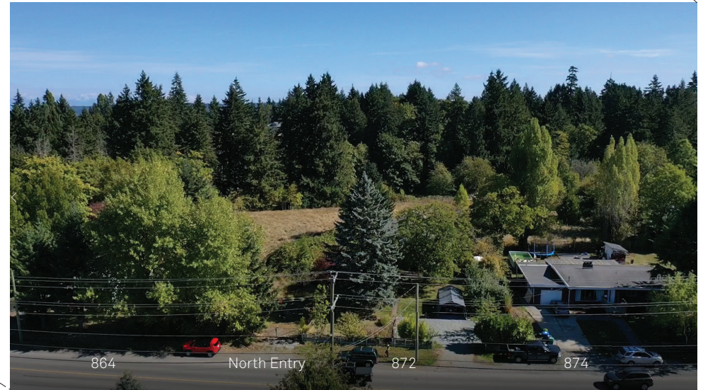
Park Ave Existing Street Aerial