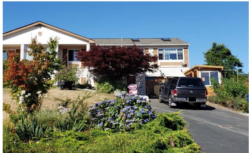
Stop Work Order posted on the front window of a structure that was also constructed at the front of the dwelling but has been removed.