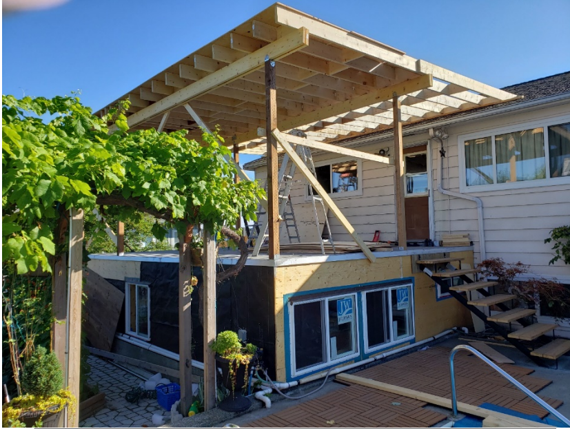
Undersized beam and columns supporting new roof structure. New floor joists being used under the deck.