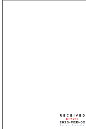
5 FINISH SCHEDULE SCALE 1/8" = 1'-0"