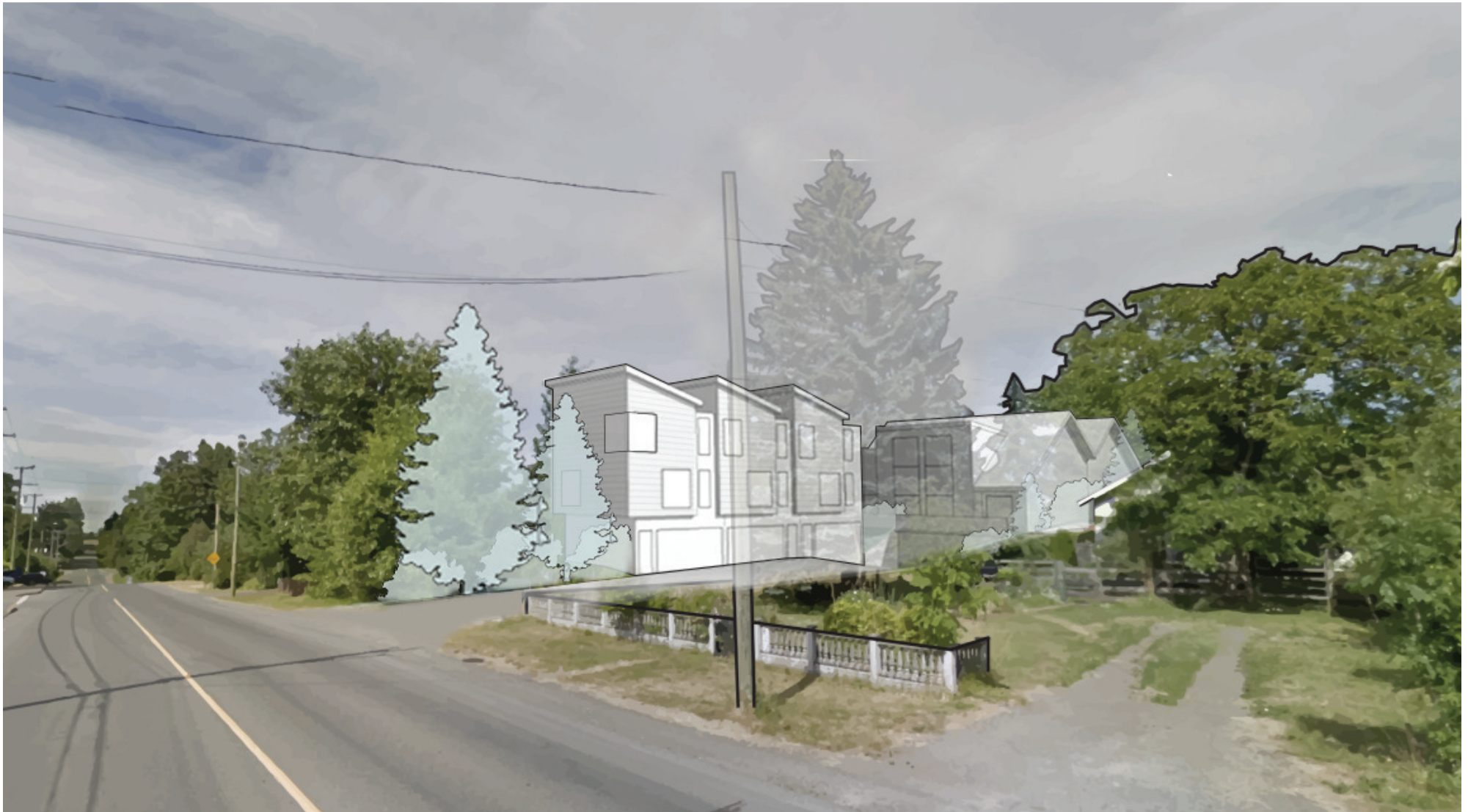
View from Park Ave & Murray St

RECEIVED RA484 2022-MAR-09 Current Planning