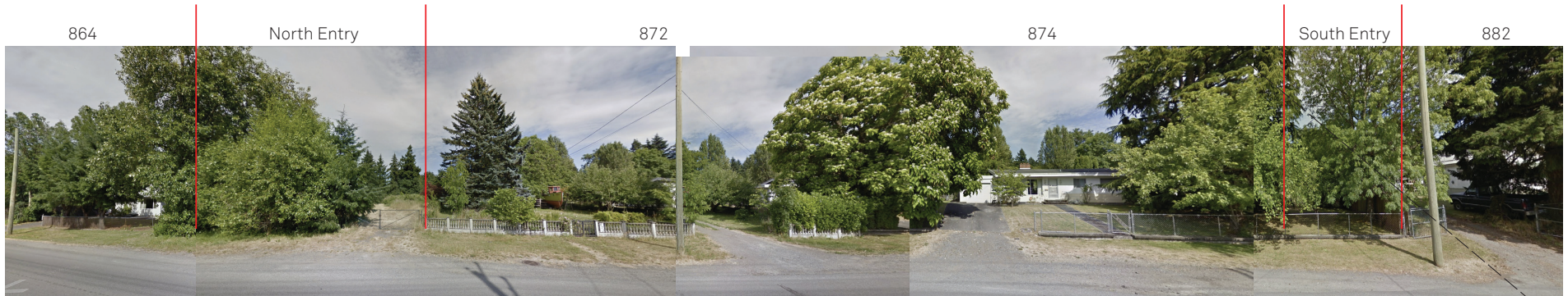
Park Ave Existing Street Elevation