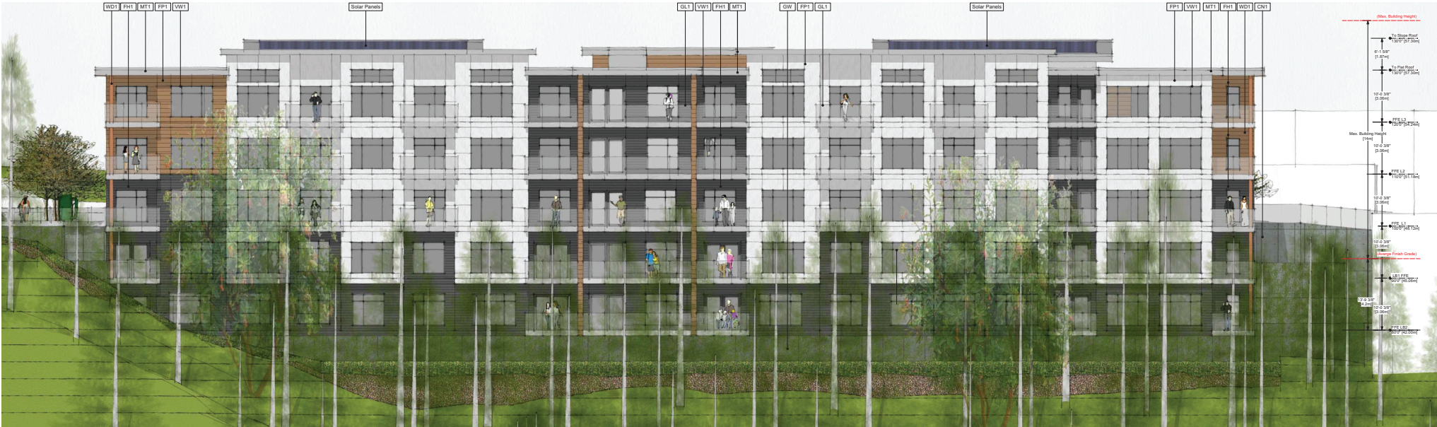
2 SOUTH ELEVATION (Facing the Millstone River)