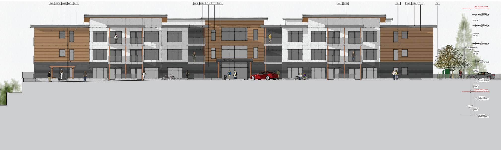
2 NORTH ELEVATION (Facing Bradley Street)