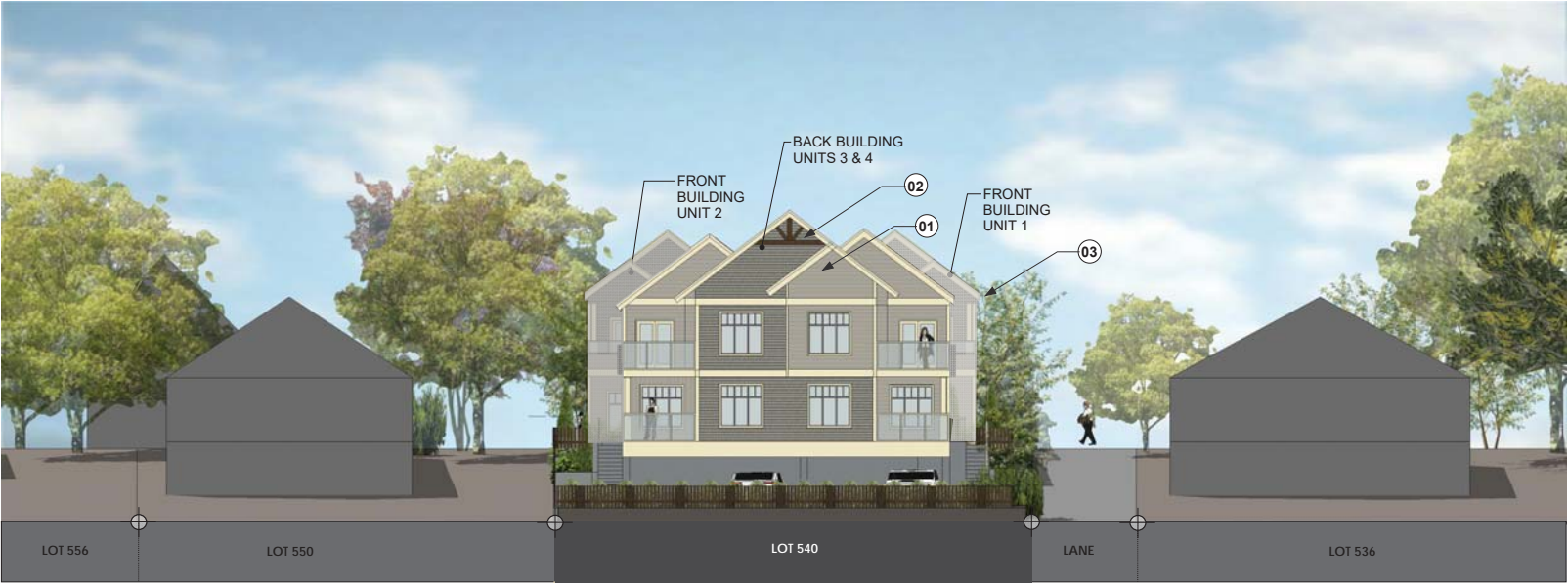
BACK ELEVATION Scale 1/8" = 1'