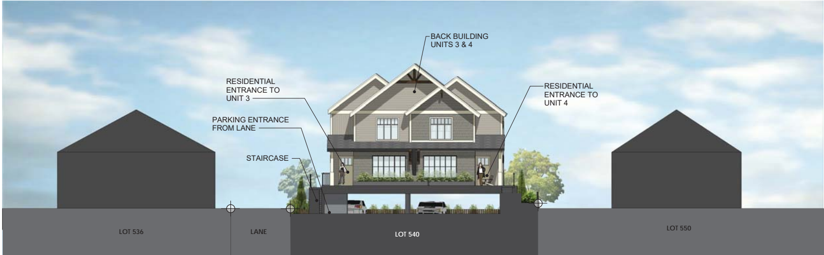
SOUTH ELEVATION, BACK BUILDING, UNIT 3 & 4 Scale 1/8" = 1'