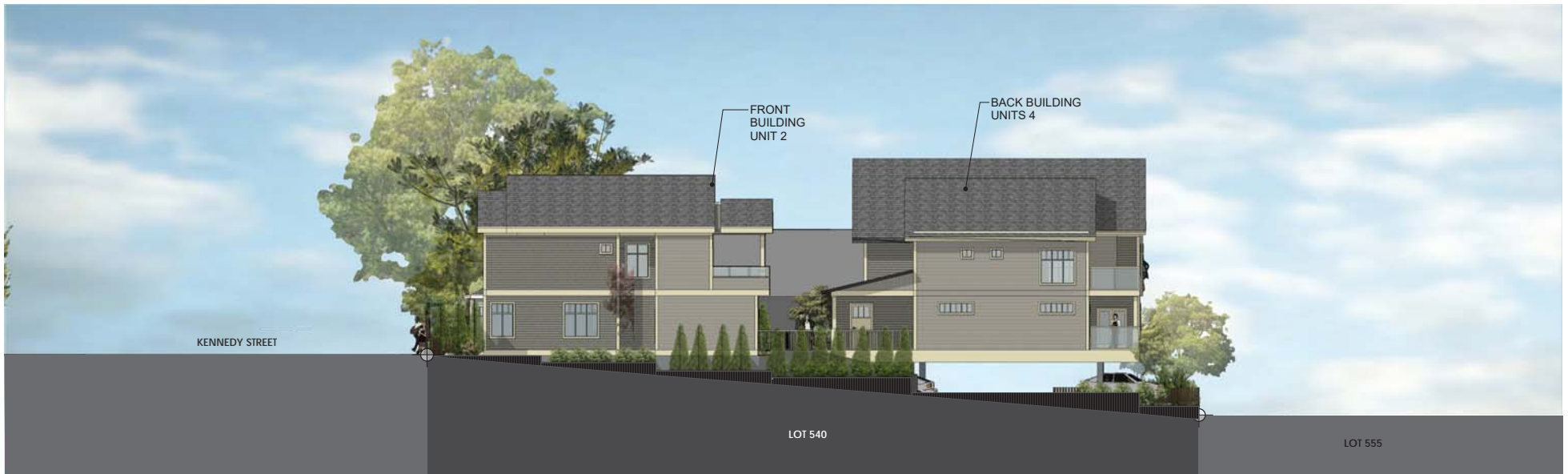
EAST ELEVATION, SIMILAR TO WEST ELEVATION Scale 1/8" = 1'