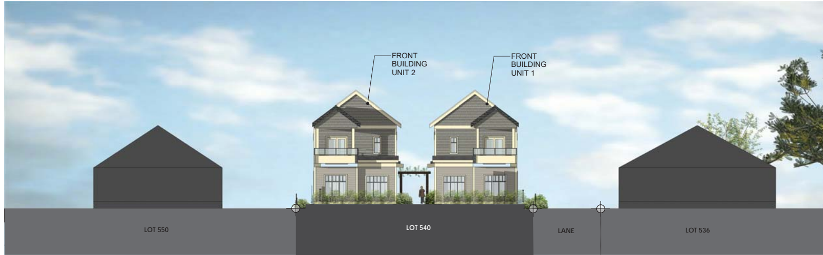
NORTH ELEVATION, FRONT BUILDINGS, UNIT 1 & 2 Scale 1/8" = 1'

RECEIVED DP1242 2022-DEC-13 CITY OF NANAIMO