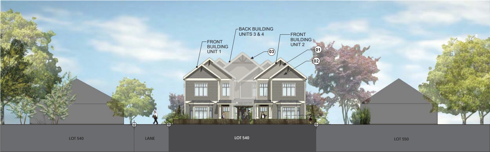
FRONT ELEVATION (FROM PINE STREET) Scale 1/8" = 1'