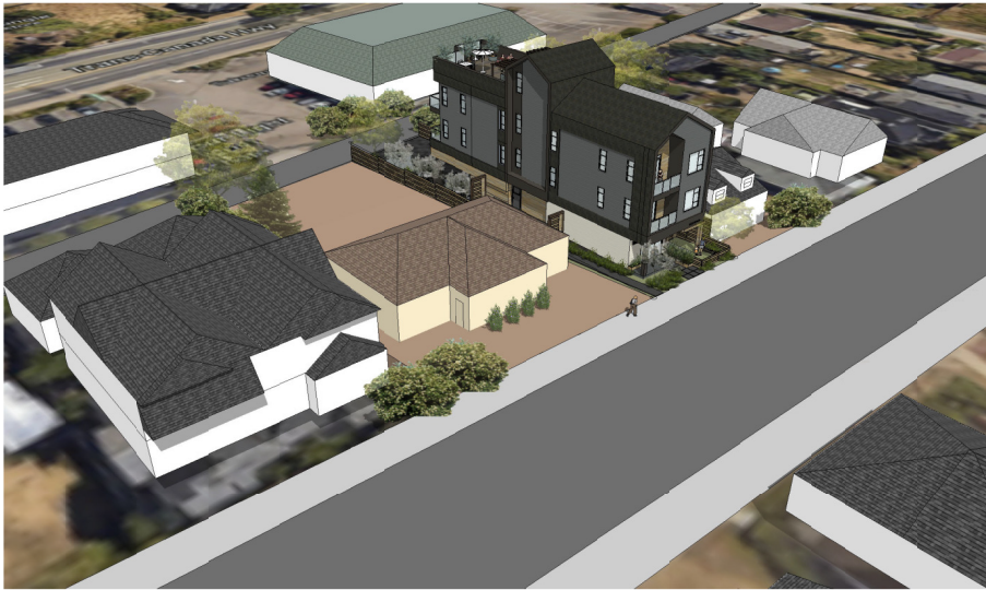
AERIAL VIEW OF SITE (FRONT)