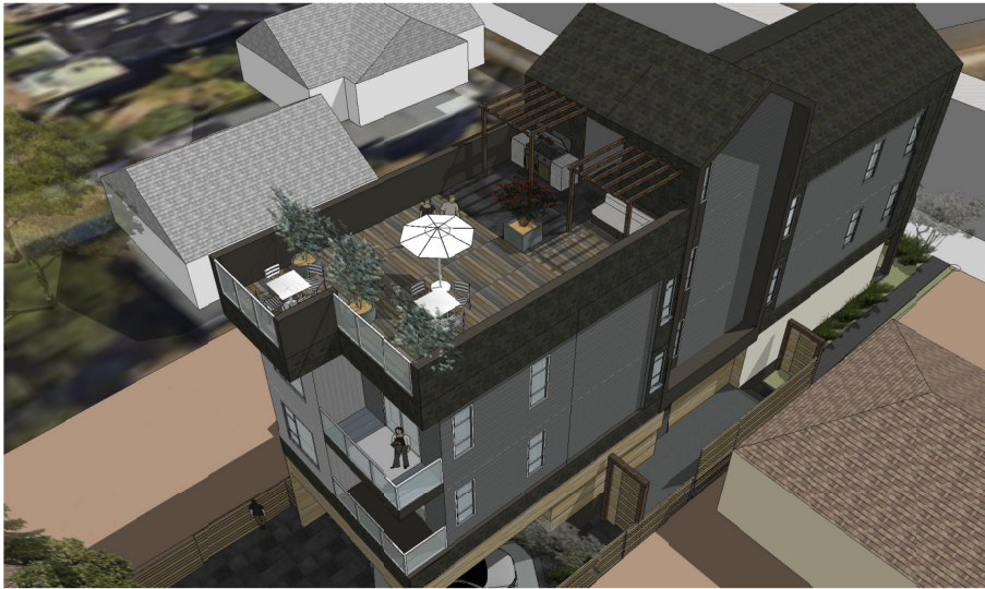
ROOF DECK VIEW