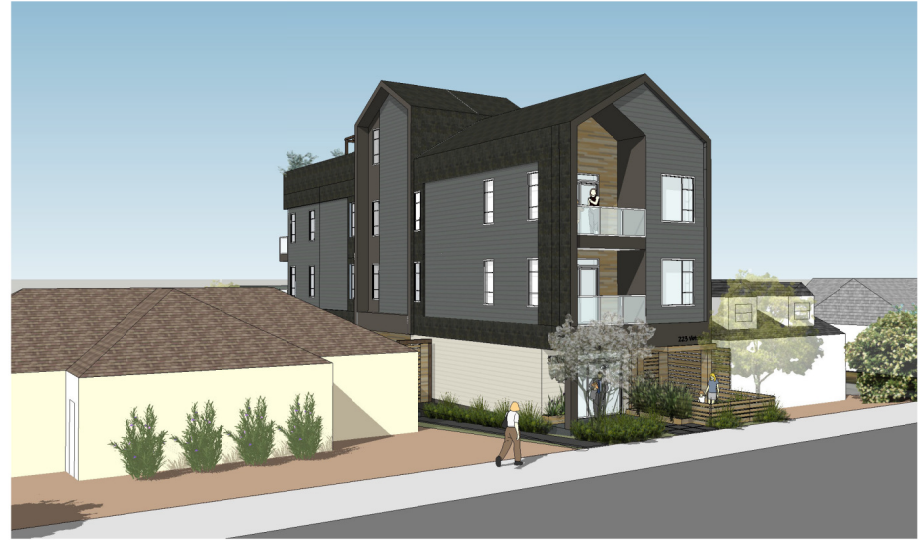
FRONT VIEW FROM VICTORIA ROAD