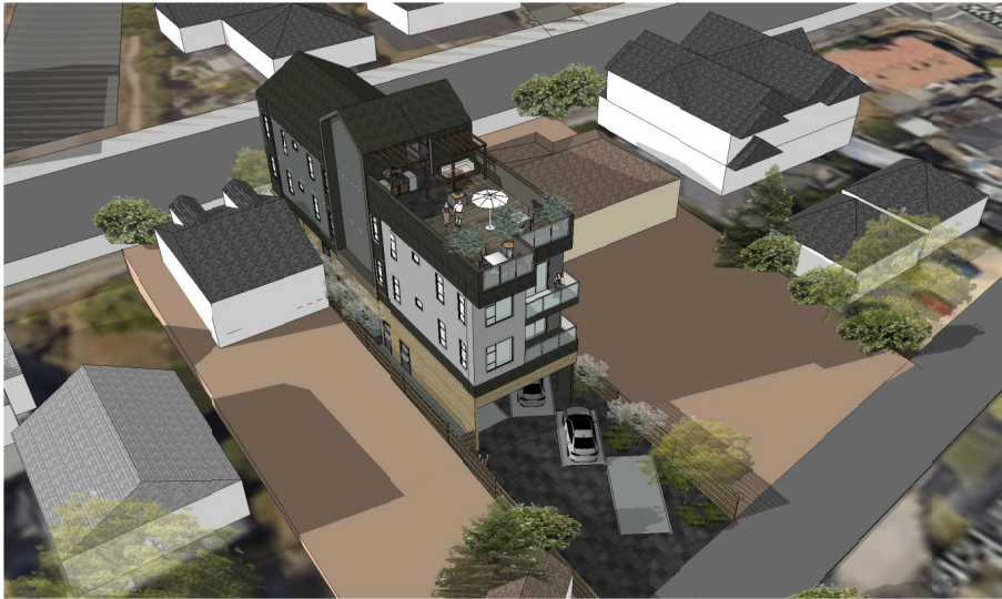
AERIAL VIEW OF SITE (REAR)