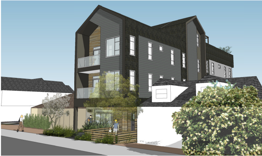
FRONT VIEW FROM VICTORIA ROAD#