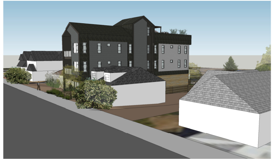
STREET VIEW OF BUILDING FROM VICTORIA ROAD

RECEIVED DP-1157 2022-DEC-12 COURT PLANNING