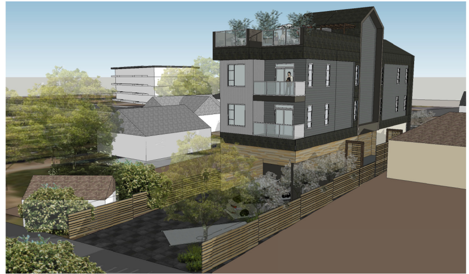
REAR VIEW OF BUILDING

RECEIVED DPI 257 2022-DEC-12 Current Planning