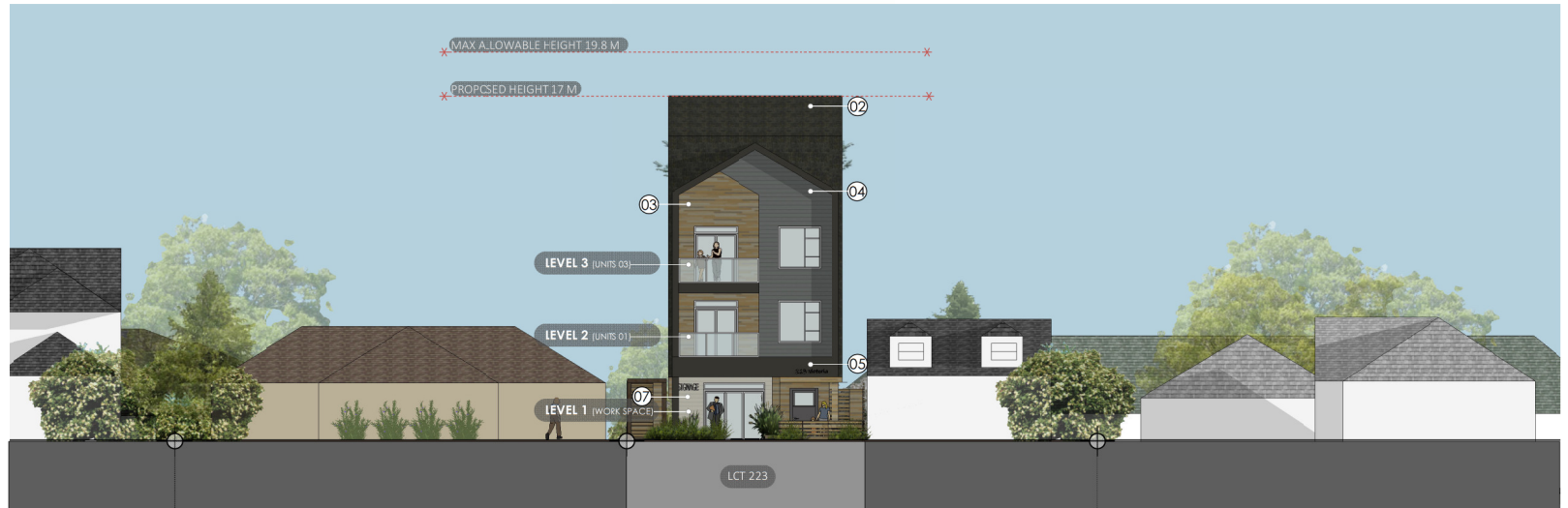
WEST ELEVATION | FOURPLEX | FROM VICTORIA ROAD | Scale 1/8" = 1' |