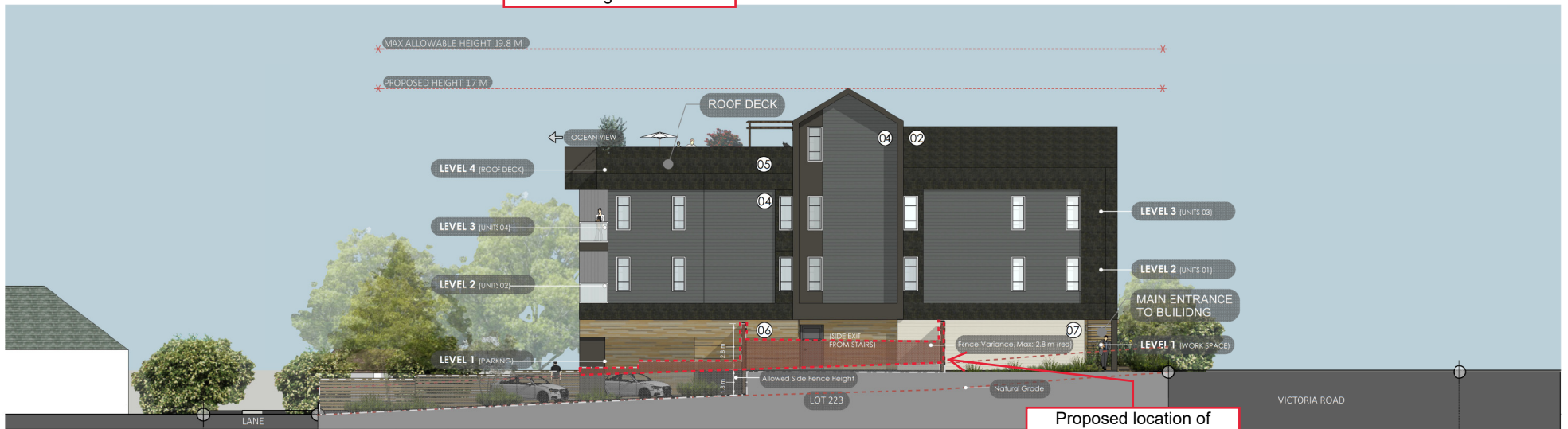
NORTH ELEVATION | FOURPLEX | SIDE ELEVATION | Scale 1/8" = 1' |

Proposed location of combined Fence/Retaining Wall Height Variance