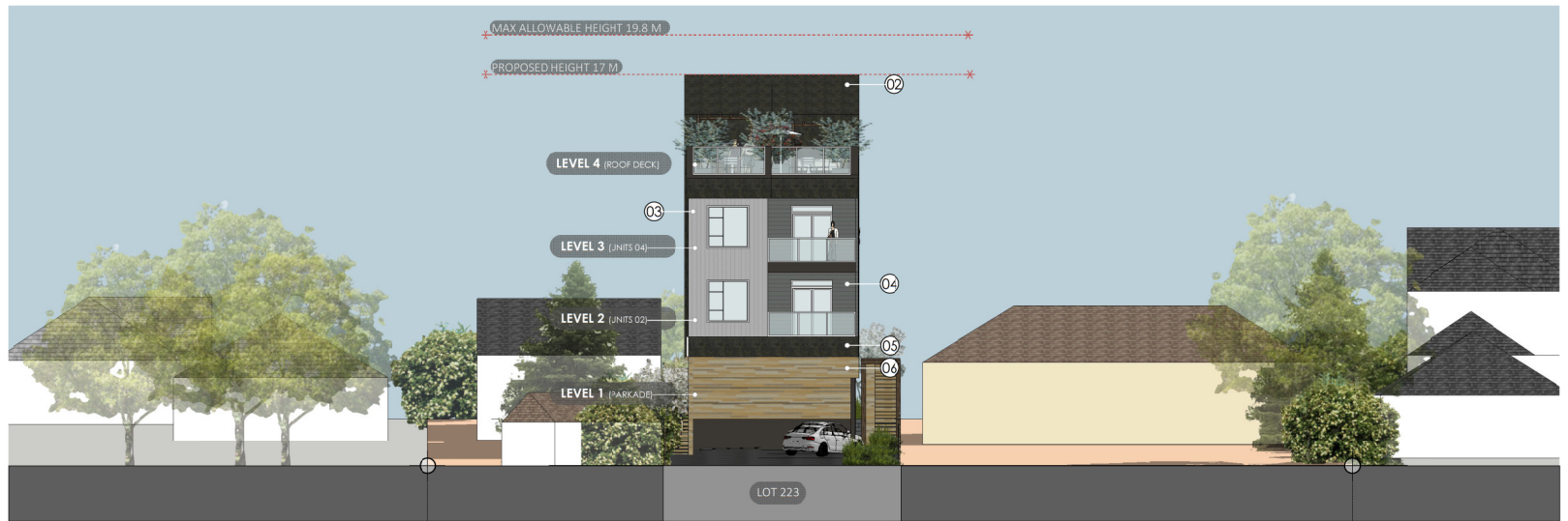
EAST ELEVATION | FOURPLEX | FROM LANE | Scale 1/8" = 1' |