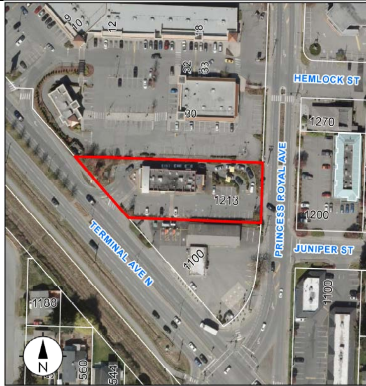
Development Variance Permit Application No. DVP00414 (1213 Princess Royal Avenue)