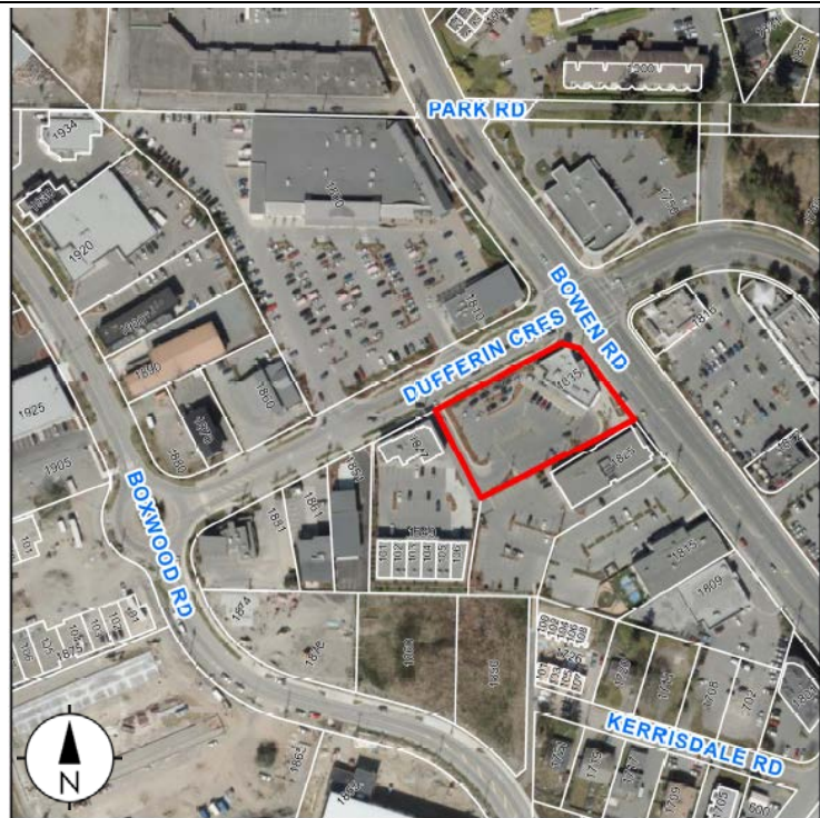
Development Variance Permit Application No. DVP00437 (1835 Bowen Road)