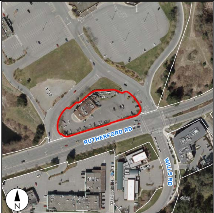
Development Variance Permit Application No. DVP00438 (4725 Rutherford Road)