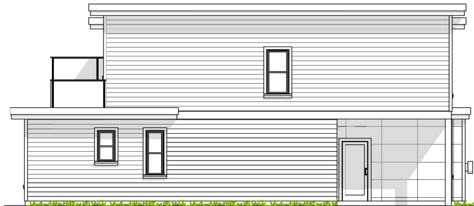
C RIGHT ELEVATION SCALE: 1/4" = 1'-0"