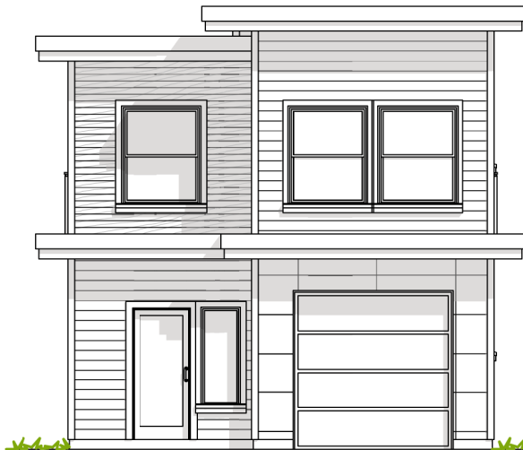
A REAR ELEVATION SL1 SCALE: 1/4" = 1'-0"