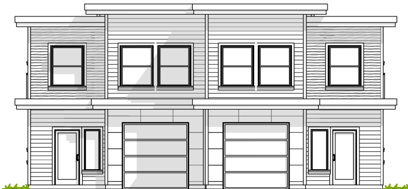
B LEFT ELEVATION SCALE: 1/4" = 1'-0"