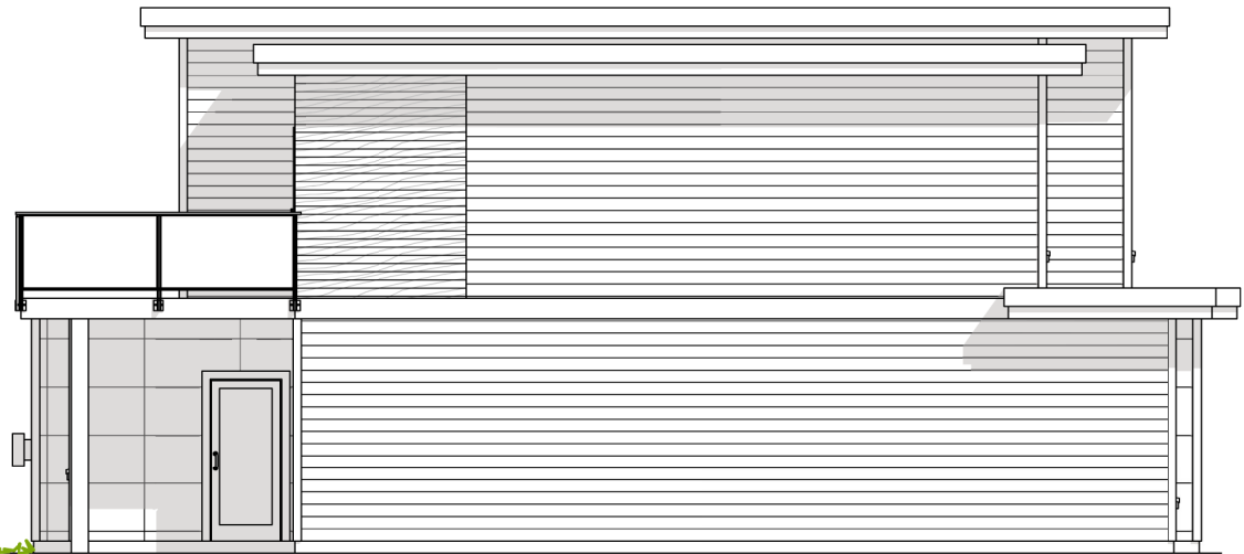
A RIGHT ELEVATION SL1 SCALE: 1/4" = 1'-0"