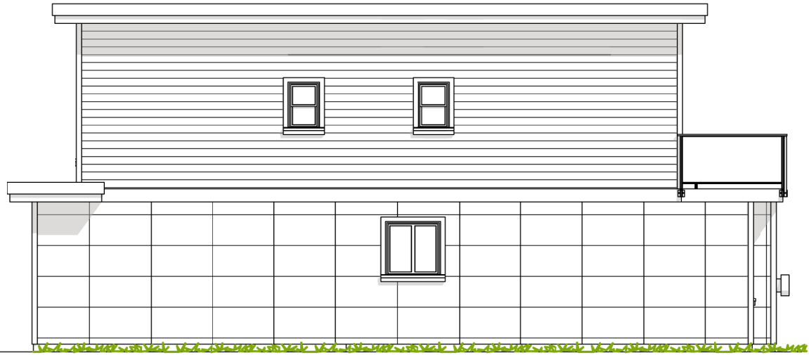
A LEFT ELEVATION SL1 SCALE: 1/4" = 1'-0"