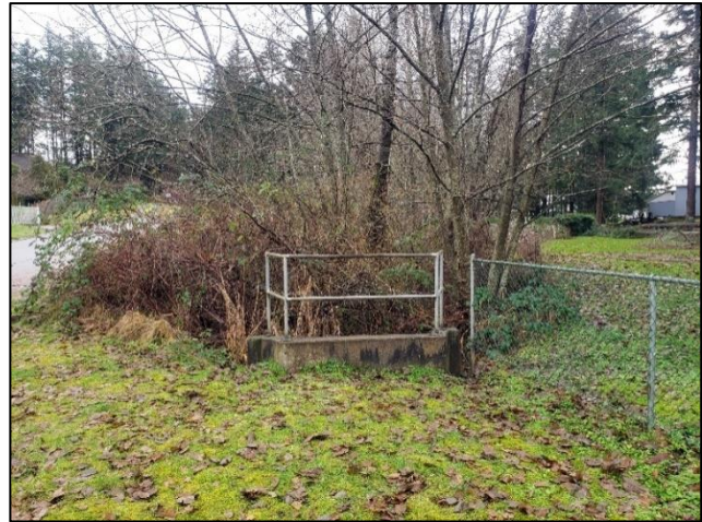
Photo 4. Southeast (downstream) view of the storm sewer outlet headwall at the northwest property corner.