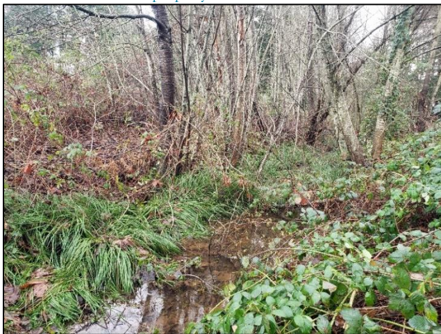
Photo 5. Downstream view typical of the northwest third of the drainage course.