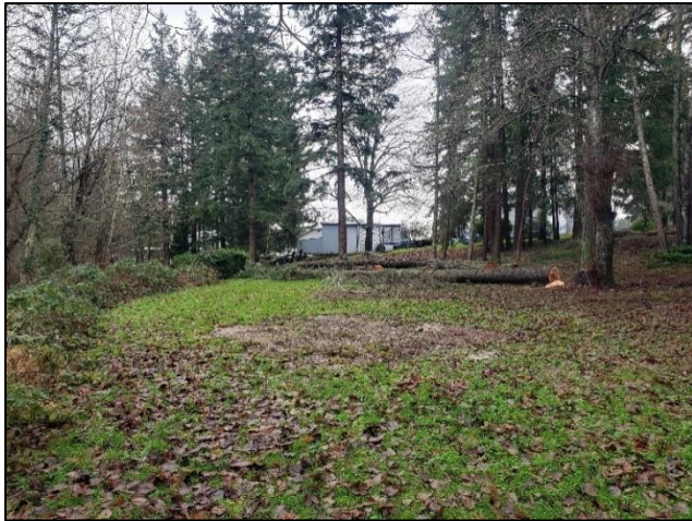
Photo 3. Southeast (downstream) view of the leave strip area along the south side of the drainage course, from the northwest property corner.