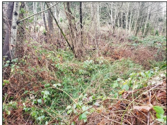
Photo 6. Downstream view of the wider section dominated by slough sedge, just upstream of the stormwater outfall from Brian's Way.