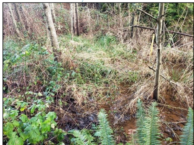
Photo 8. North view of the wide section at the east edge of the property.