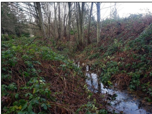
Photo 7. Upstream view of the narrow section downstream of the storm outfall from Brian's Way.